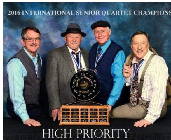
High Priority is our 2024 Headliner Quartet from the Far Western District

HARMONY CAMP IS FUN: ringing chords, friends, ice cream, tag singing, music coaches, a capella / barbershop, international quartet champions, ping pong, woodshedding, vocal production, singing, quartet coaching.