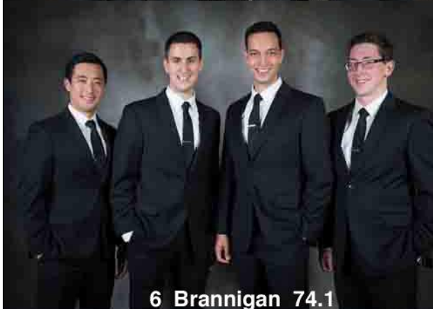
6 Brannigan 74.1