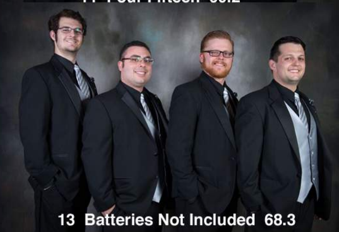
13 Batteries Not Included 68.3