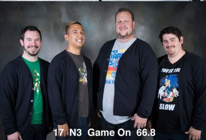
17 N3 Game On 66.8