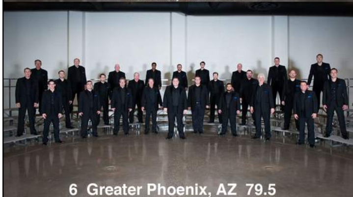
6 Greater Phoenix, AZ 79.5