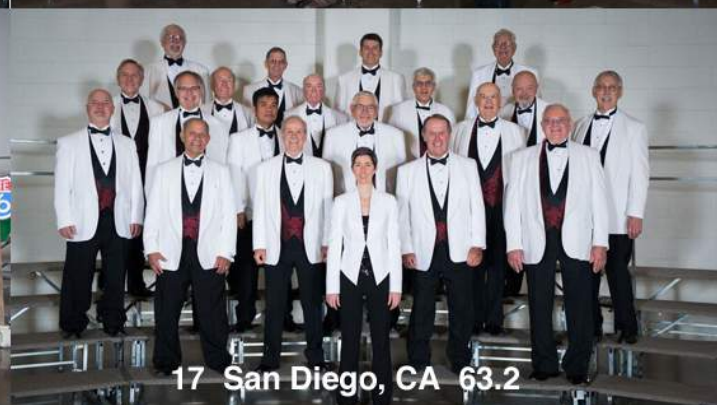
17 San Diego, CA 63.2