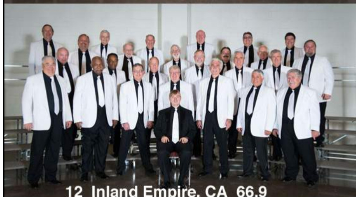
12 Inland Empire, CA 66.9