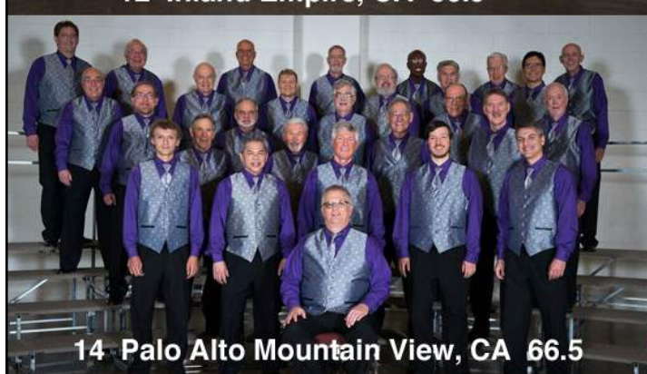
14 Palo Alto Mountain View, CA 66.5