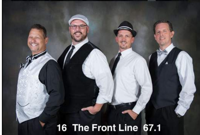
16 The Front Line 67.1