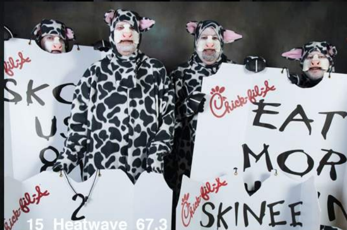
15 Heatwave 67.3