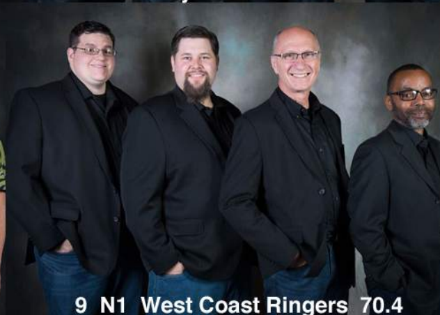
9 N1 West Coast Ringers 70.4