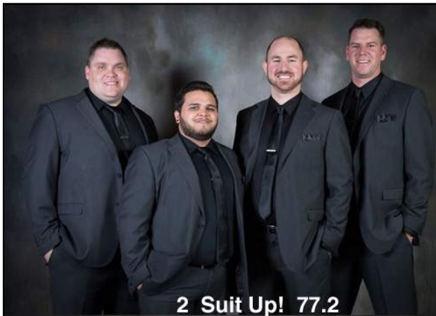
2 Suit Up! 77.2