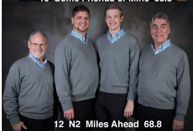
12 N2 Miles Ahead 68.8