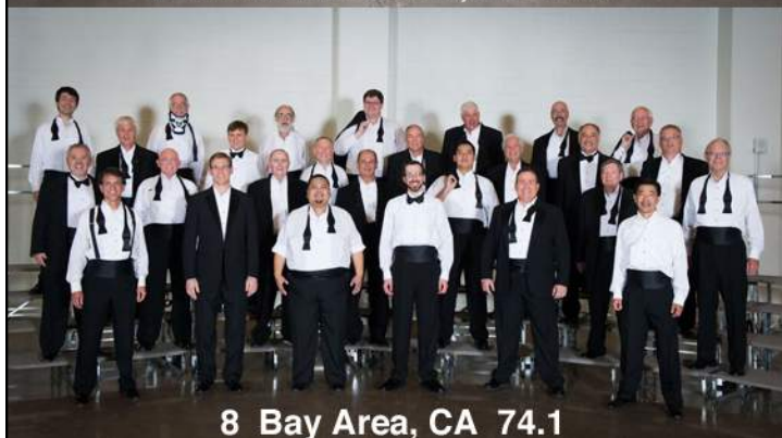
8 Bay Area, CA 74.1