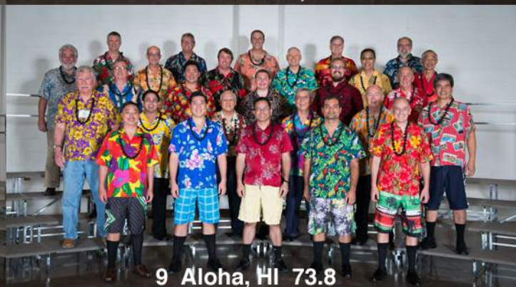
9 Aloha, HI 73.8