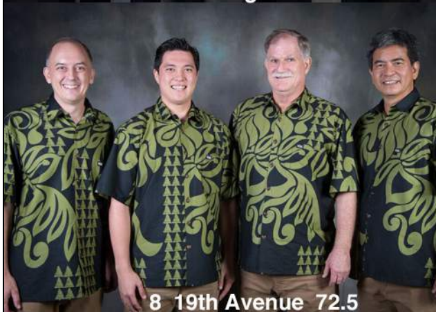
8 19th Avenue 72.5