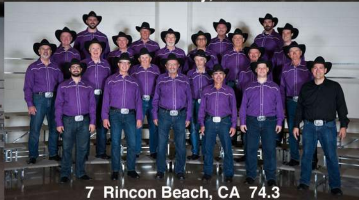
7 Rincon Beach, CA 74.3