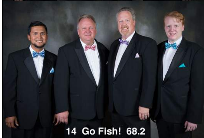
14 Go Fish! 68.2