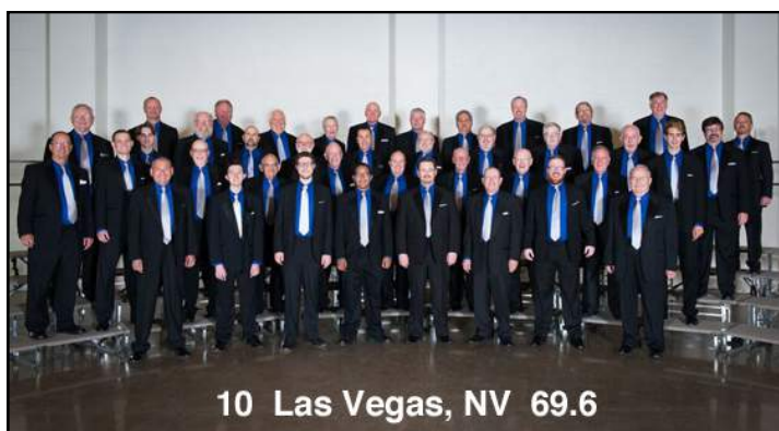
10 Las Vegas, NV 69.6