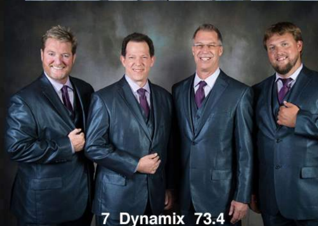
7 Dynamix 73.4