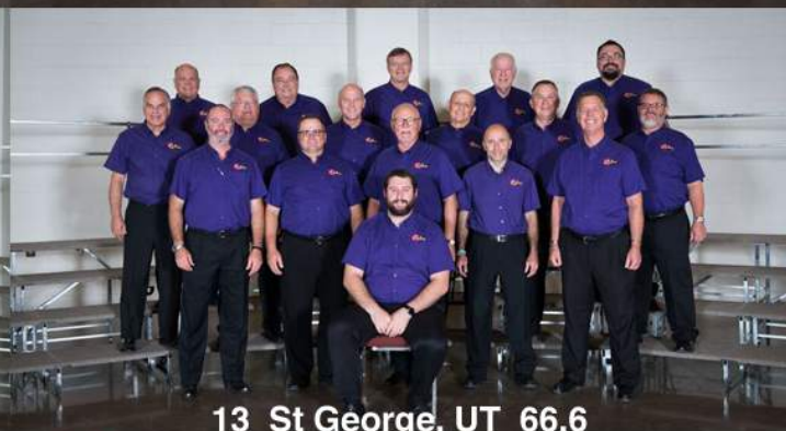
13 St George, UT 66.6