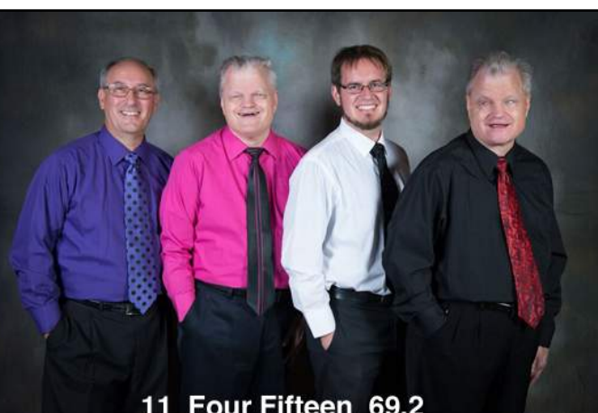
11 Four Fifteen 69.2