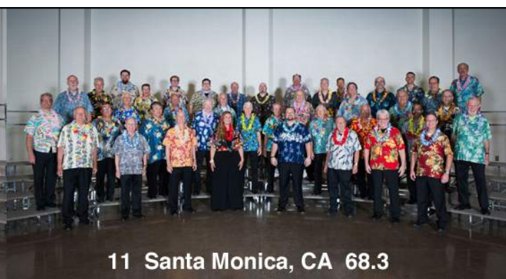
11 Santa Monica, CA 68.3