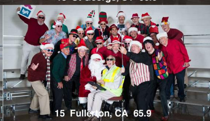
15 Fullerton, CA 65.9