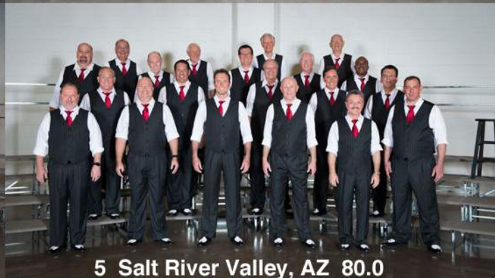
5 Salt River Valley, AZ 80.0