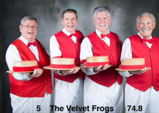
5 The Velvet Frogs 74.8