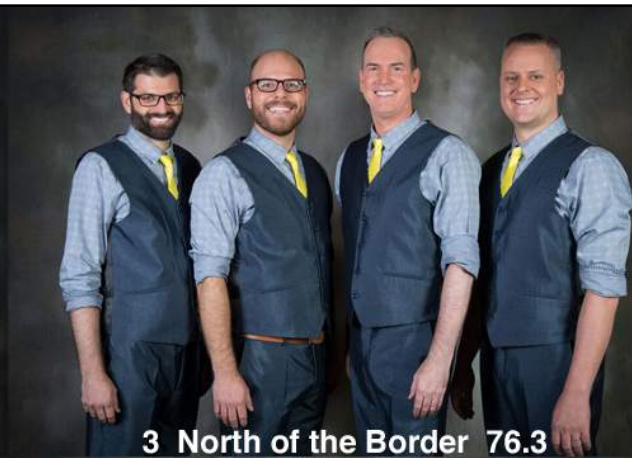
3 North of the Border 76.3