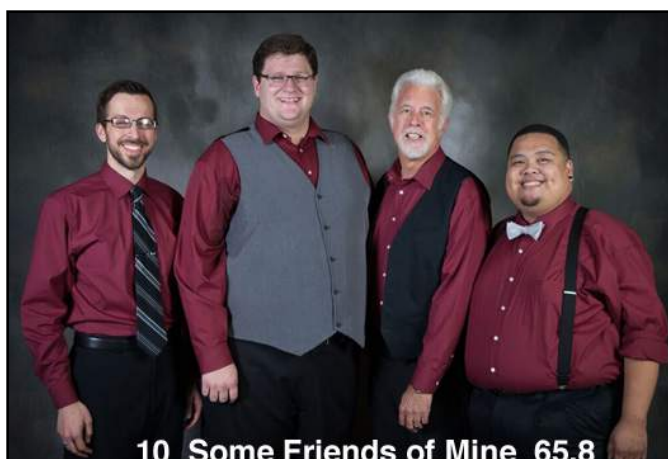
10 Some Friends of Mine 65.8