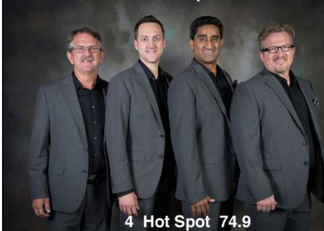
4 Hot Spot 74.9