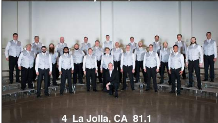
4 La Jolla, CA 81.1