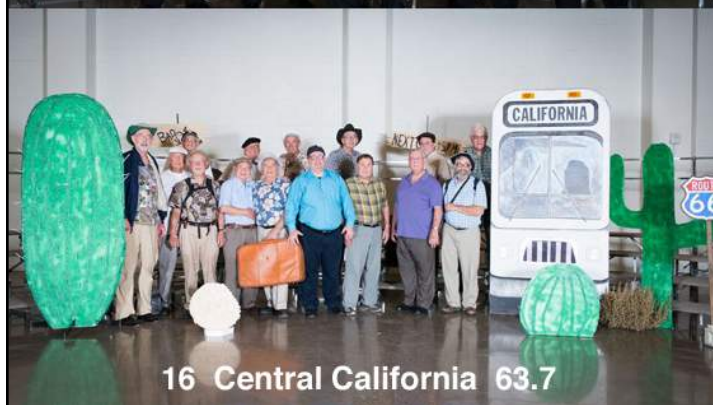
16 Central California 63.7