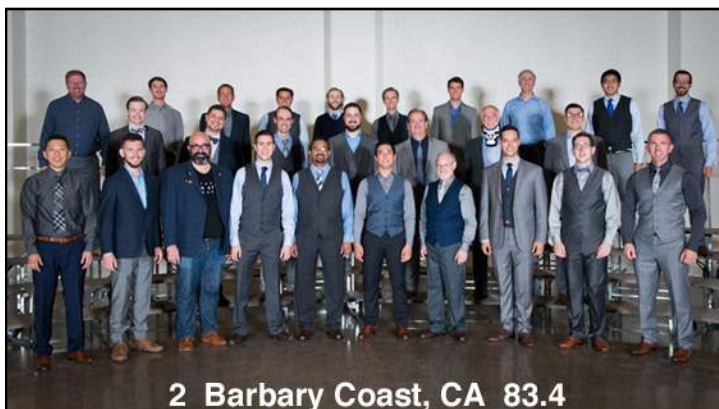
2 Barbary Coast, CA 83.4