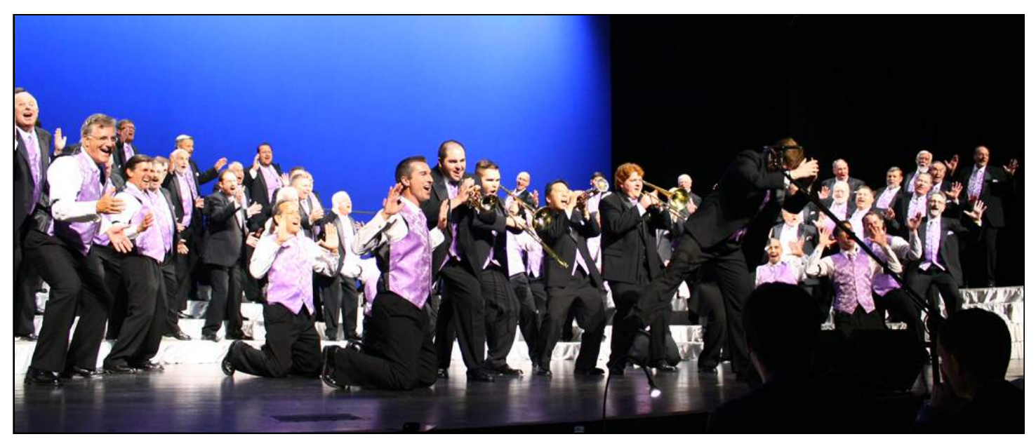
2015 FWD Champion Chorus The MOH

6 WESTUNES · Spring 2016 Volume 66 No. 1