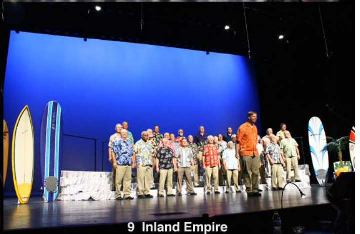
9 Inland Empire