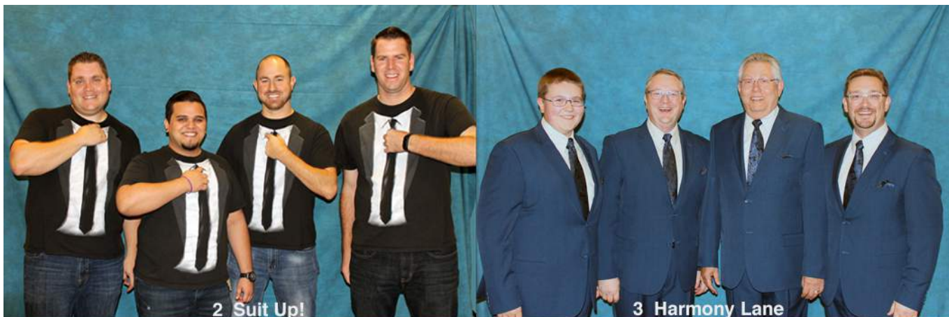
2 Suit Up!