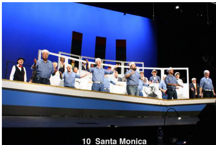
10 Santa Monica