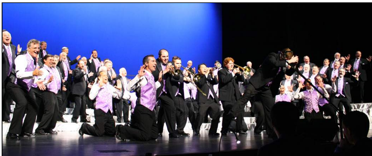
2015 FWD Chorus Champion The Masters of Harmony