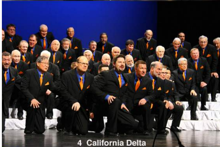
4 California Delta