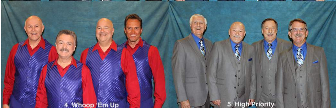
4 Whoop 'Em Up