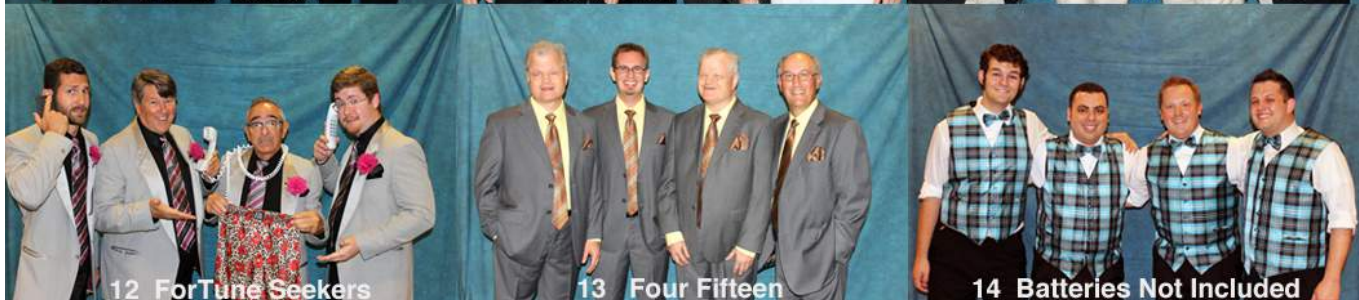
12 ForTune Seekers