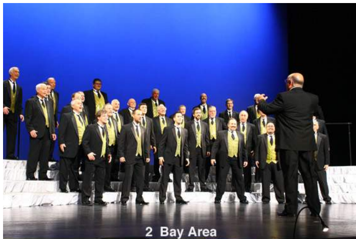
2 Bay Area