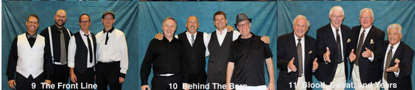
9 The Front Line