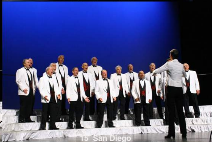
15 San Diego