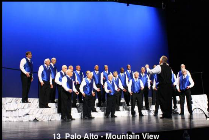
13 Palo Alto - Mountain View