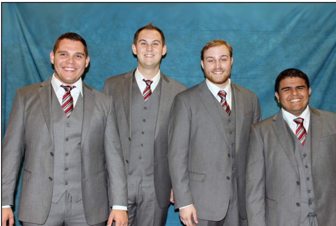
2015 FWD Quartet Champion Flightline

WESTUNES, established in 1951, is the official publication of the Far Western District Association of Chapters in the Barbershop Harmony Society