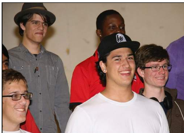
Happiness is ...