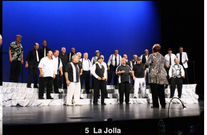
5 La Jolla