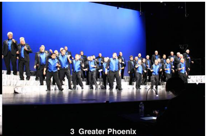
3 Greater Phoenix