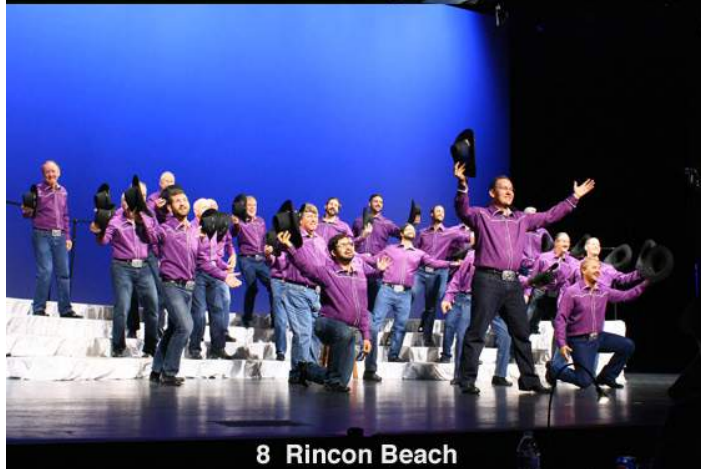
8 Rincon Beach