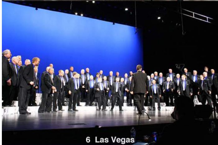
6 Las Vegas