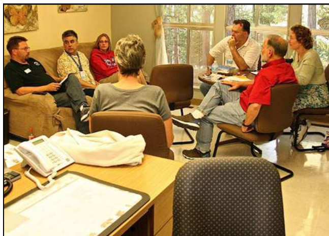
High School Teachers Discover Barbershop