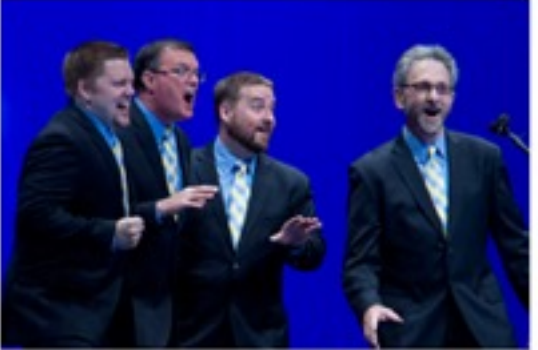
34th American Pastime

13th Artistic License 16th The Newfangled Four 25th Vocal Edition