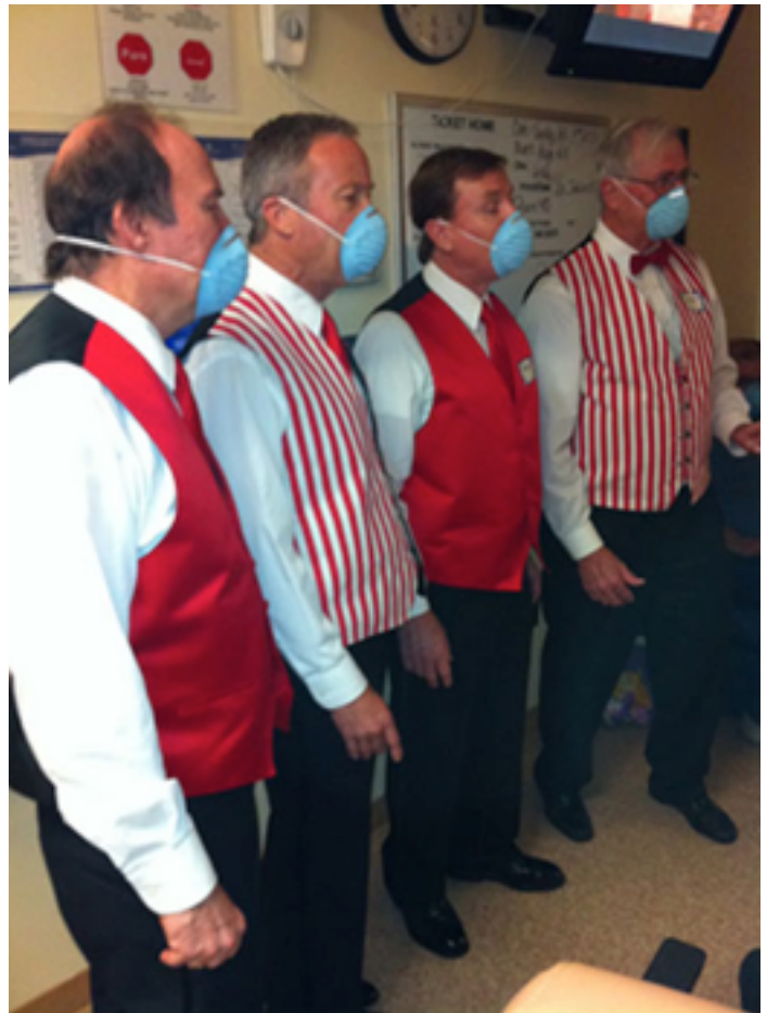
The Quartet sings in appropriate hospital face masks.