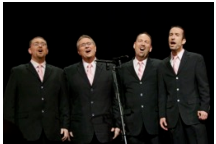
2012 FWD Quartet Champions 95 North