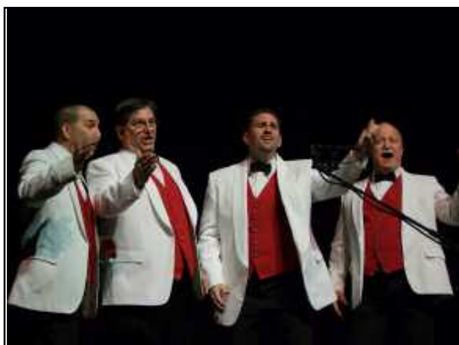
9 Mother's Favorite 61.6

The rest of the FWD International Preliminary Quartet Contest competitors.