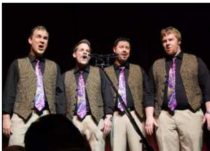
3 Artistic License 80.7