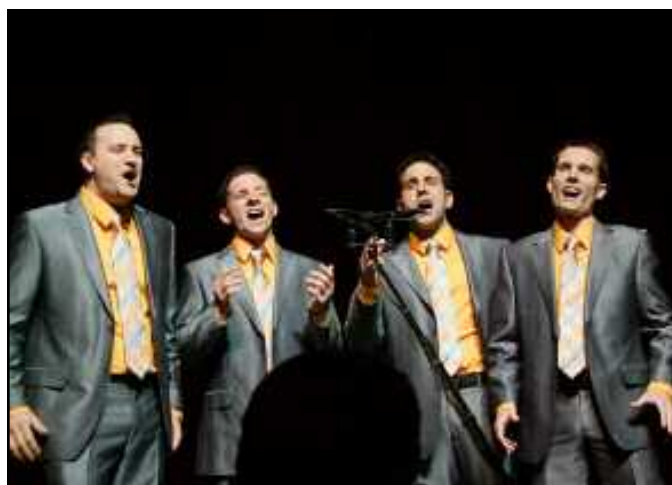
2 The Crush 84.1