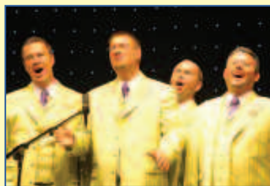
2010 BHS INTERNATIONAL QUARTET CHAMPIONS