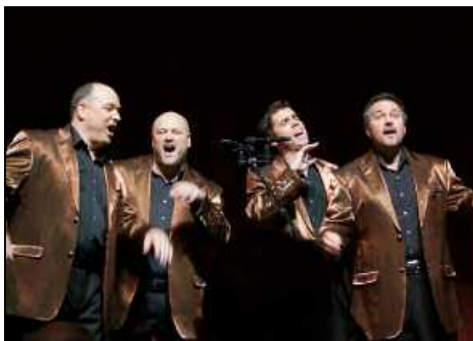
1 Masterpiece 87.4