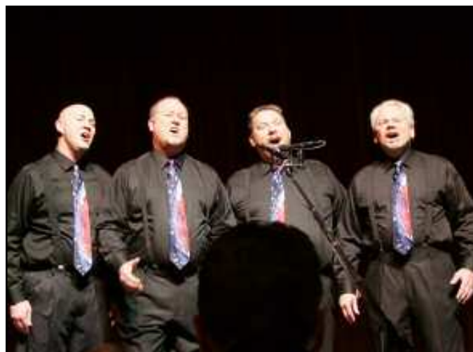
8 The American Heralds 66.6