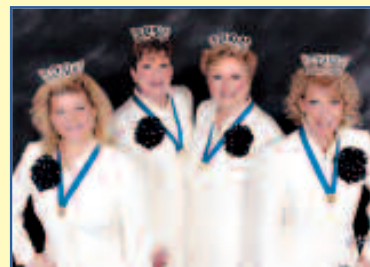
2011 SWEET ADELINES INTERNATIONAL QUARTET CHAMPIONS