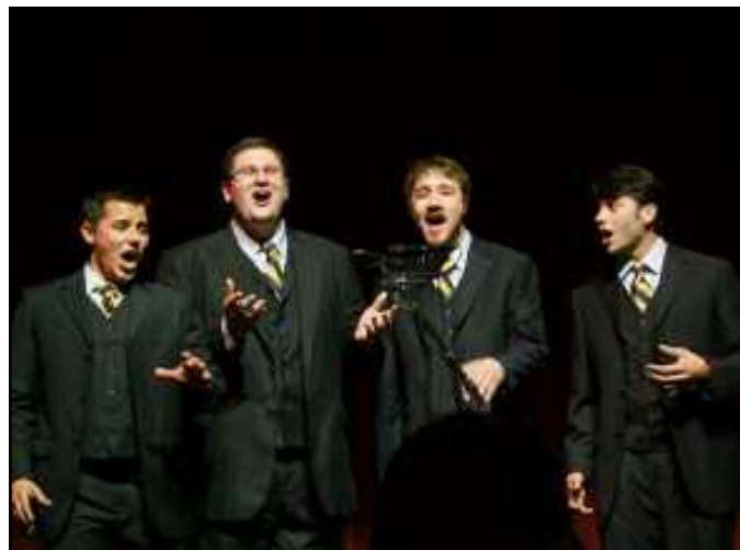
6 First Strike 67.6