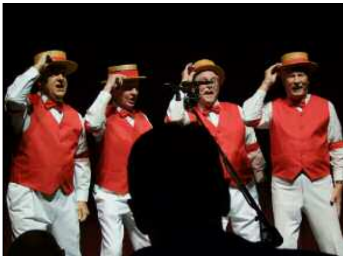
5 Velvet Frogs 70.5