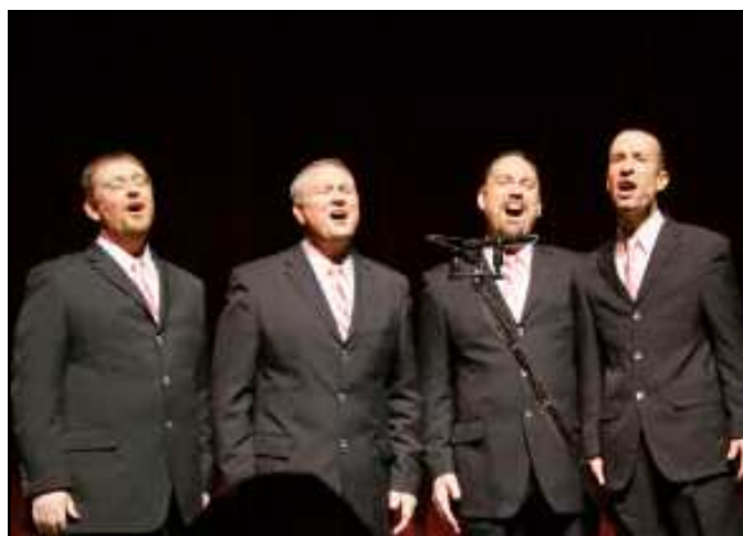
4 95 North 77.9

The FAR WESTERN DISTRICT includes Arizona, California, Hawaii, Nevada and Southern Utah