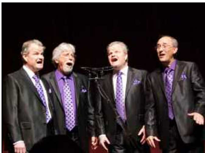
7 Four Fifteen 66.6