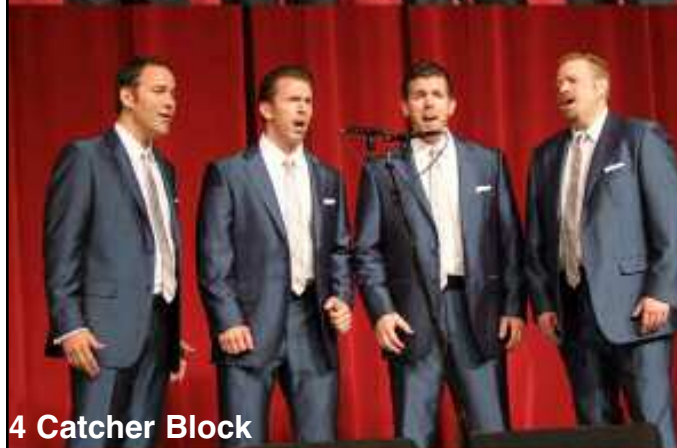
4 Catcher Block