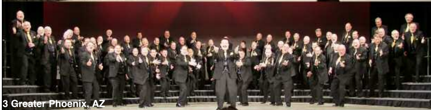
3 Greater Phoenix, AZ