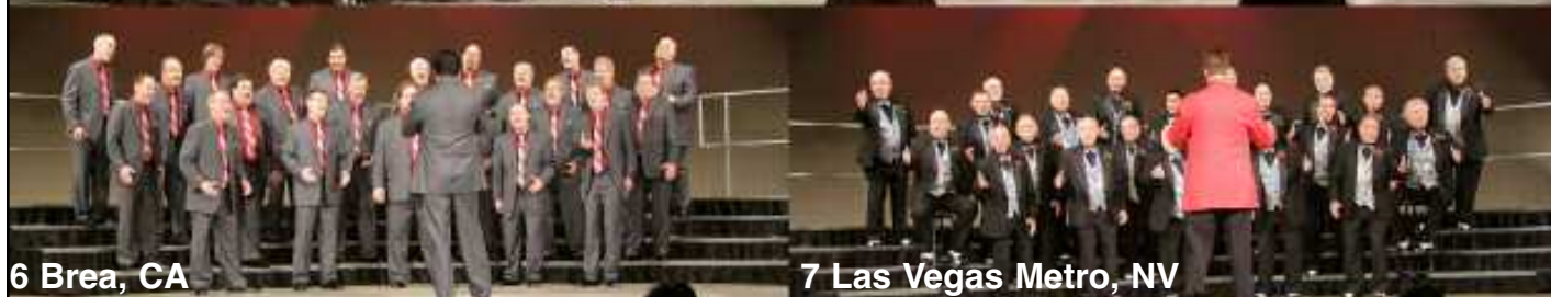
6 Brea, CA