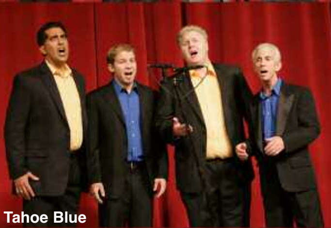
7 Tahoe Blue