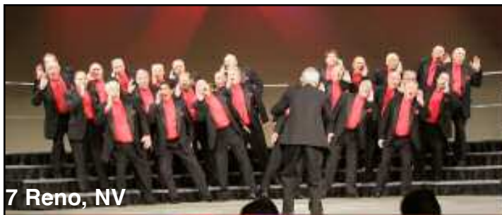
7 Reno, NV