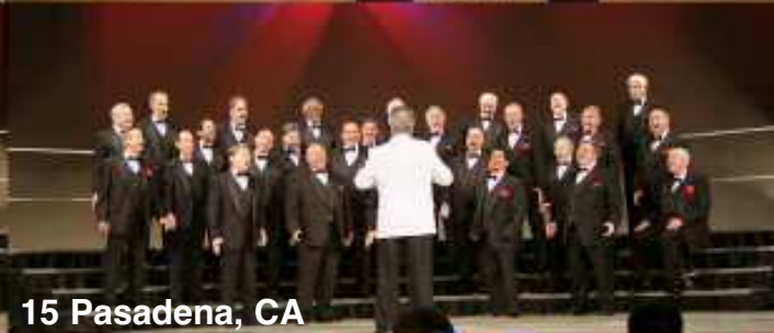
15 Pasadena, CA