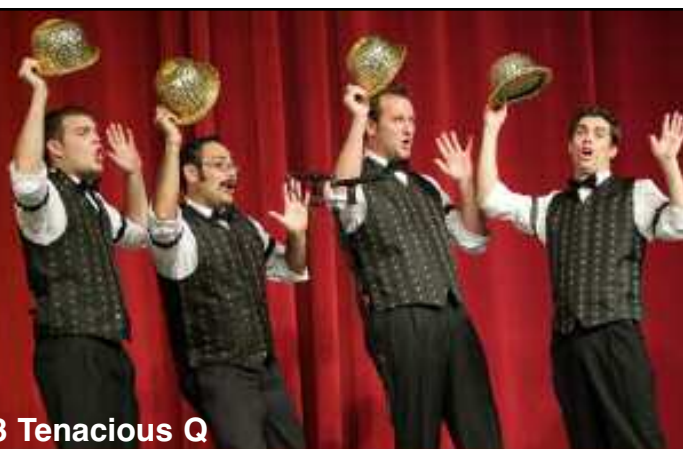
3 Tenacious Q