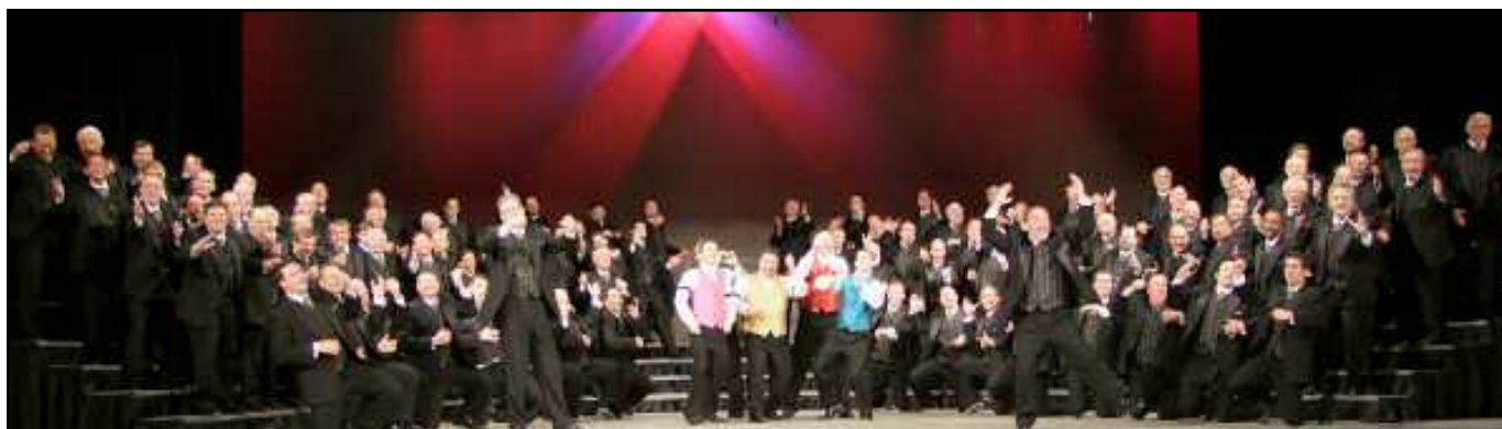
2010 FWD Chorus Champions - Masters of Harmony

The FAR WESTERN DISTRICT includes Arizona, California, Hawaii, Nevada and Southern Utah