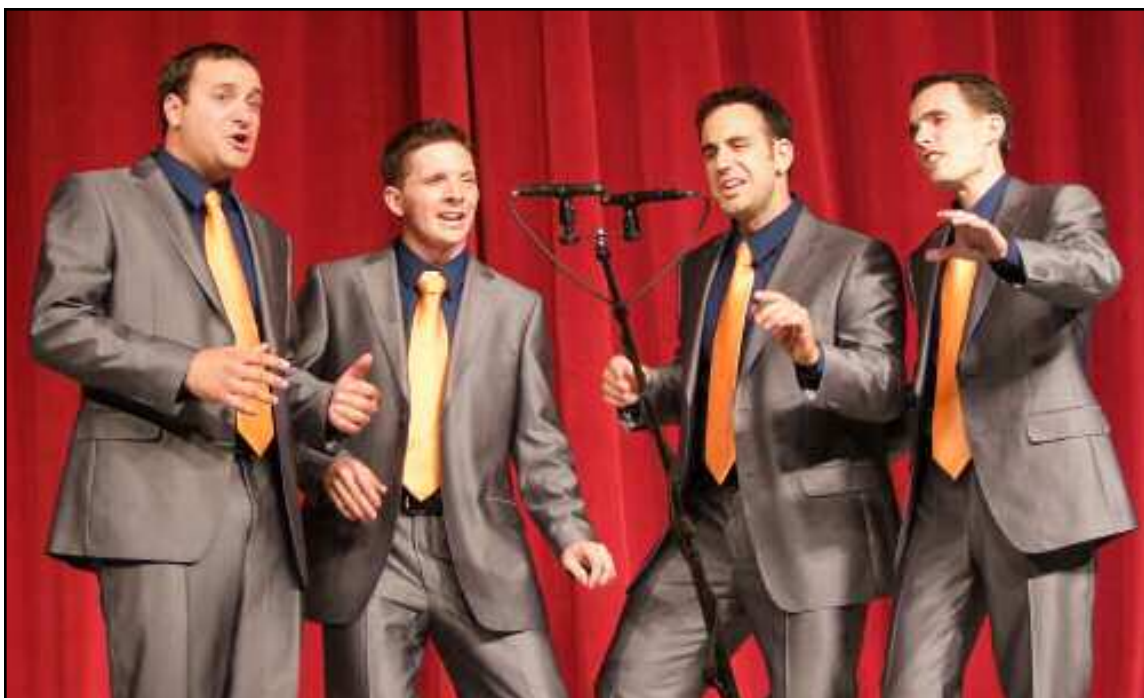
2010 FWD Quartet Champions - The Crush

WESTUNES, established in 1951, is the official publication of the Far Western District Association of Chapters in the Barbershop Harmony Society, Inc.