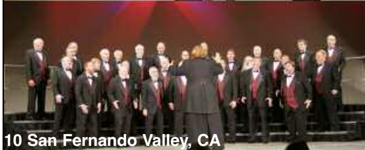
10 San Fernando Valley, CA