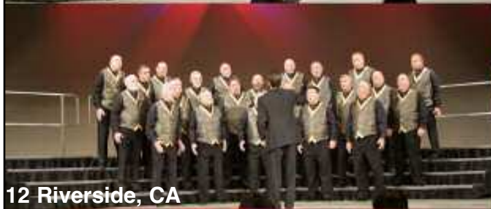
12 Riverside, CA