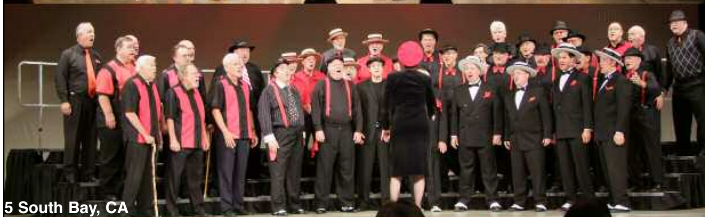
5 South Bay, CA