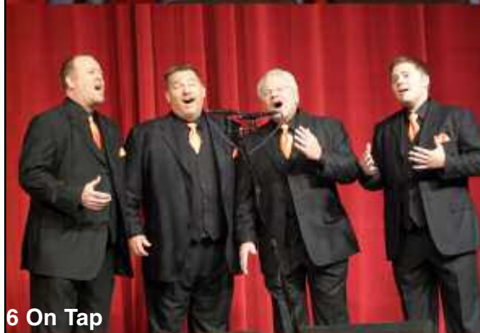
6 On Tap