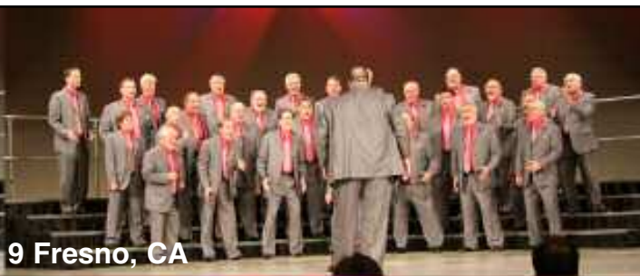
9 Fresno, CA