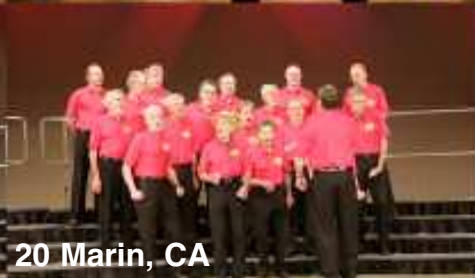
20 Marin, CA