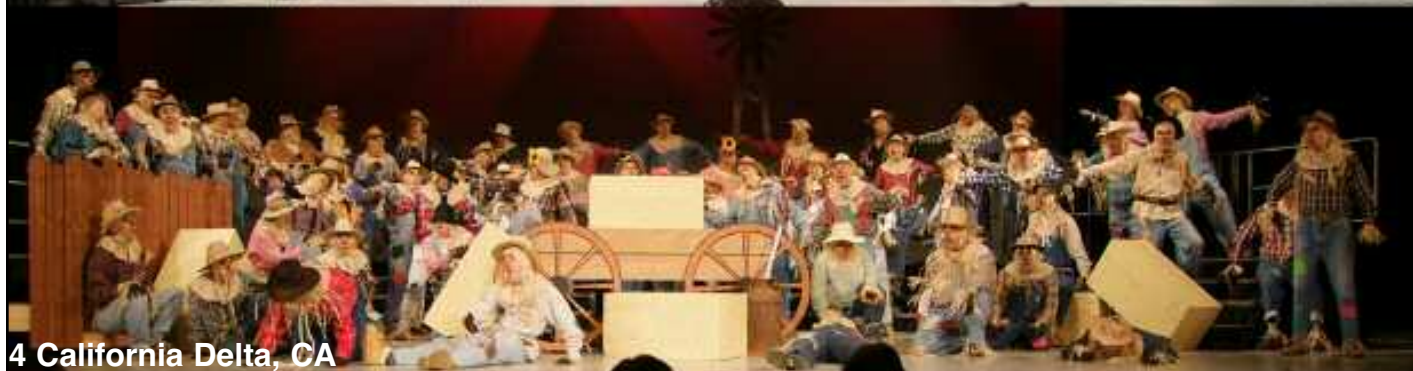
4 California Delta, CA