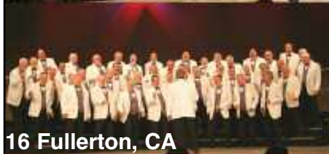
16 Fullerton, CA