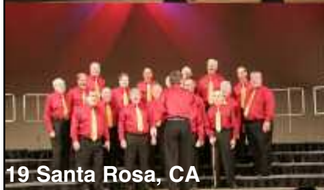
19 Santa Rosa, CA