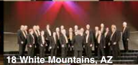
18 White Mountains, AZ