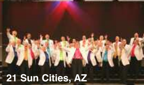
21 Sun Cities, AZ