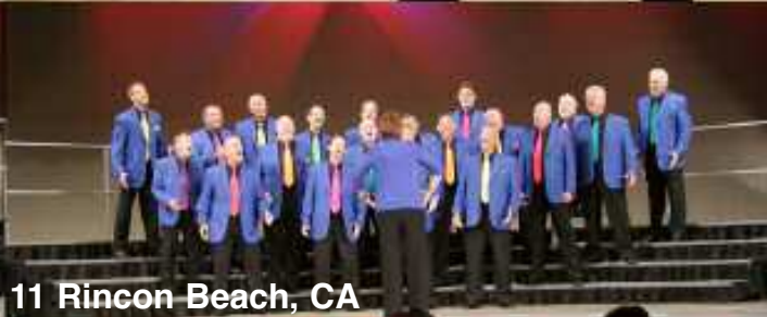
11 Rincon Beach, CA