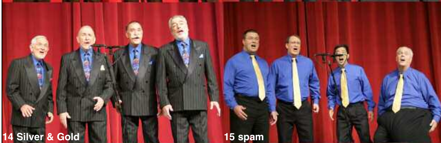
14 Silver & Gold