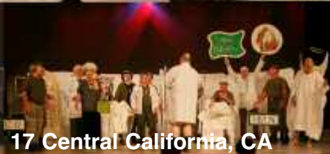
17 Central California, CA