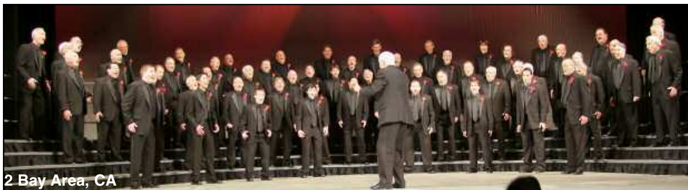
2 Bay Area, CA