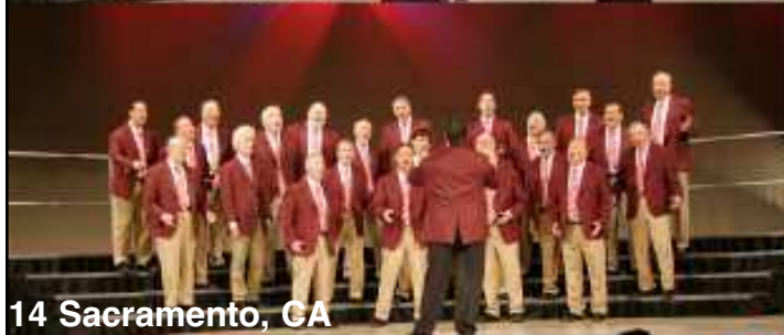
14 Sacramento, CA