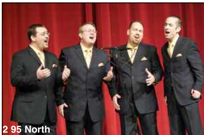
2 95 North