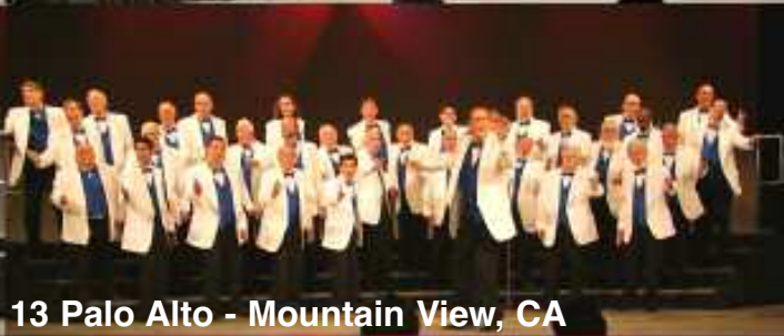
13 Palo Alto - Mountain View, CA