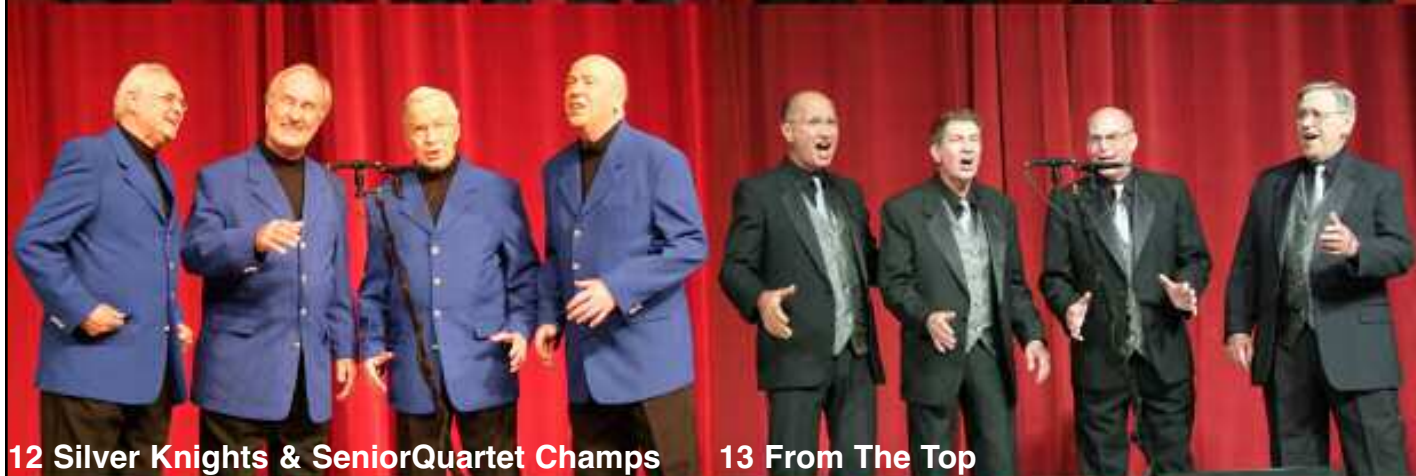
12 Silver Knights & SeniorQuartet Champs