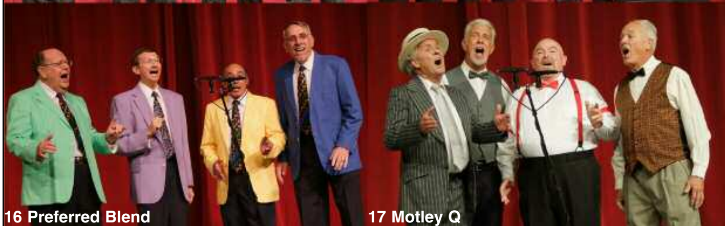
16 Preferred Blend