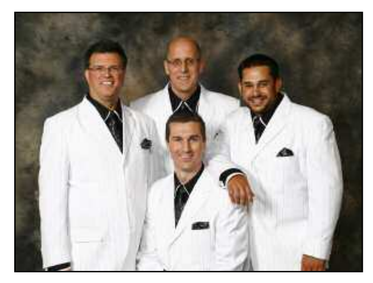
2009 FWD Quartet Champions The Edge