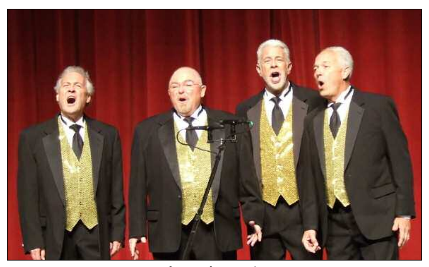
2009 FWD Senior Quartet Champions Motley Q