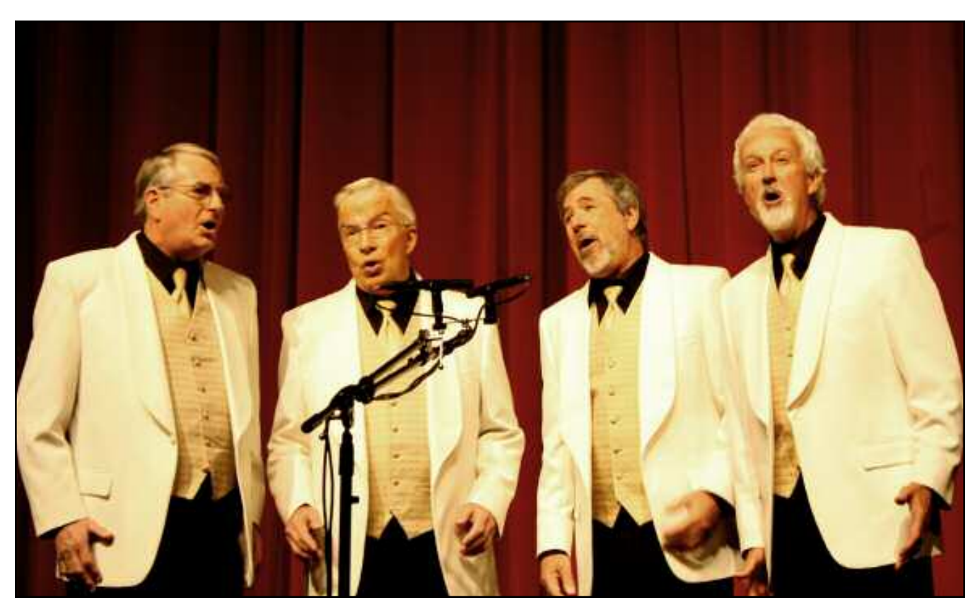
2010 2nd Place International Senior Quartet Vintage Gold