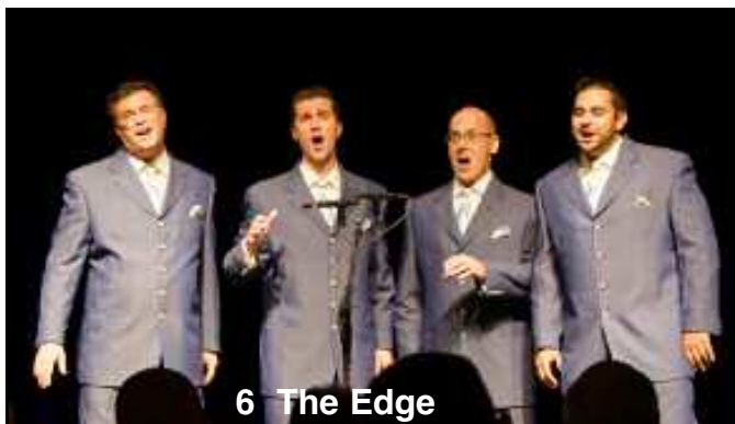
6 The Edge