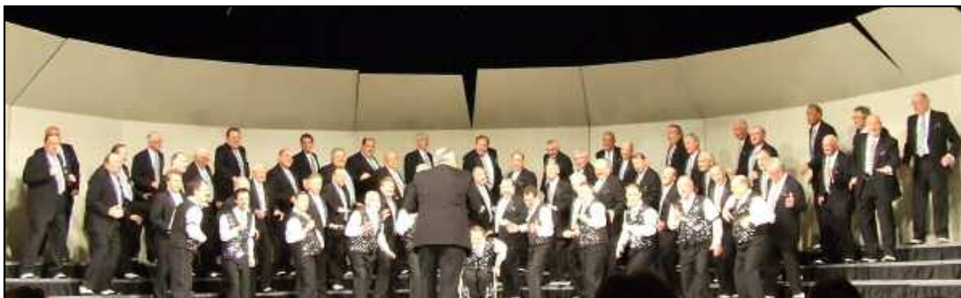
Greater Phoenix, Phoenix, AZ

Mic-Tester Chorus: Independence, OH - Men of Independence