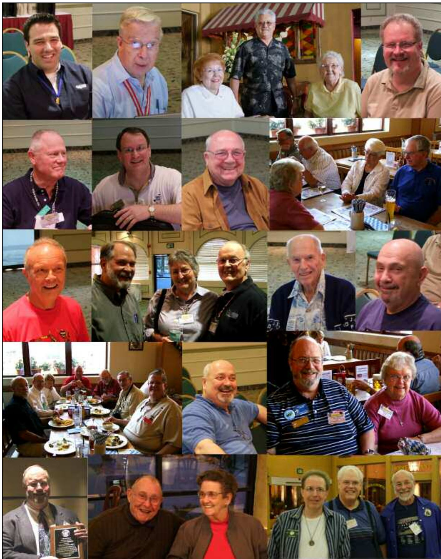
People seen around the International Spring Preliminary Contest and Convention in Las Vegas.