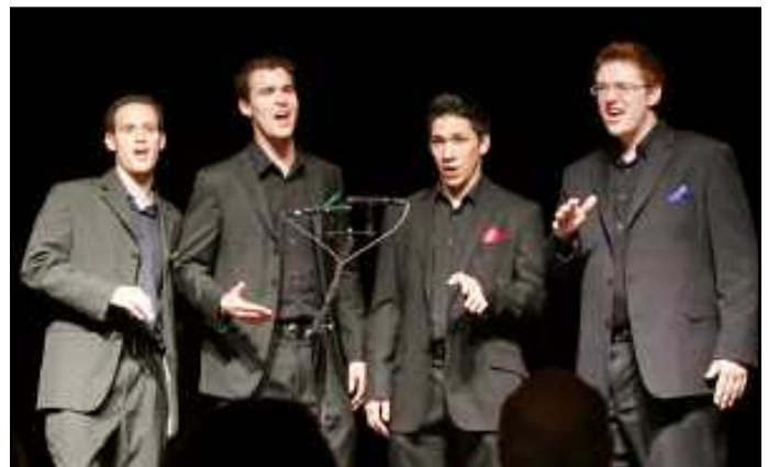
RMD College Quartet Cosmo