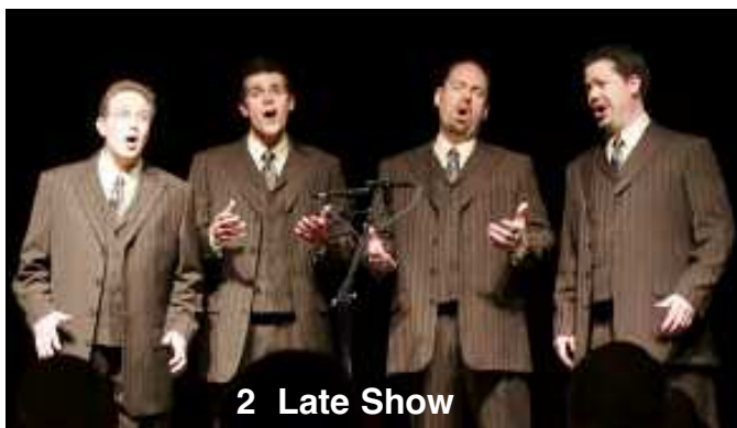
2 Late Show