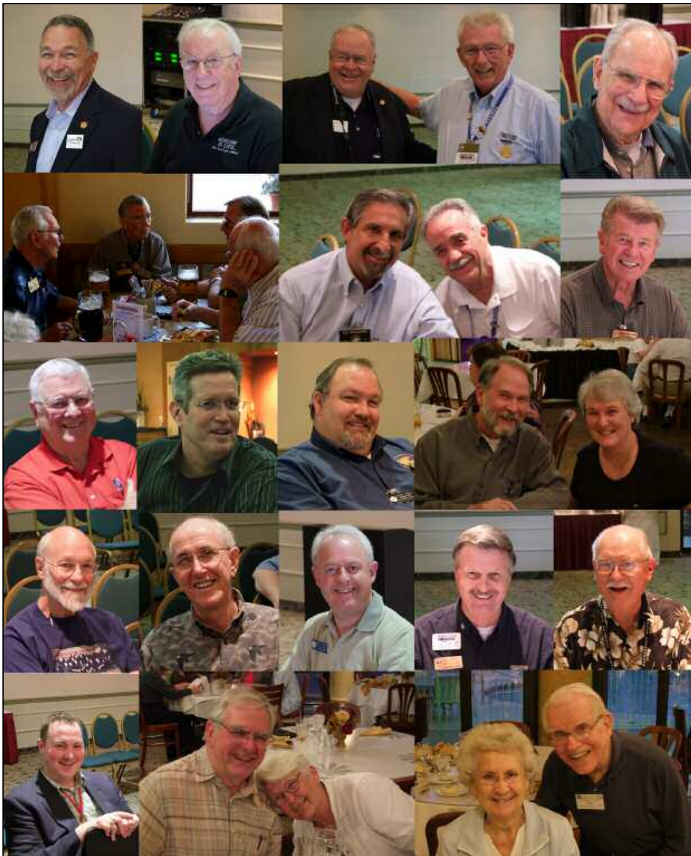
People seen around the International Spring Preliminary Contest and Convention in Las Vegas.