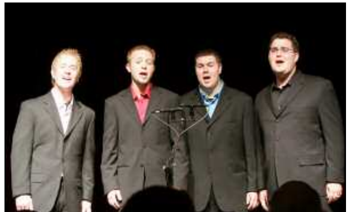
RMD College Quartet Revolution