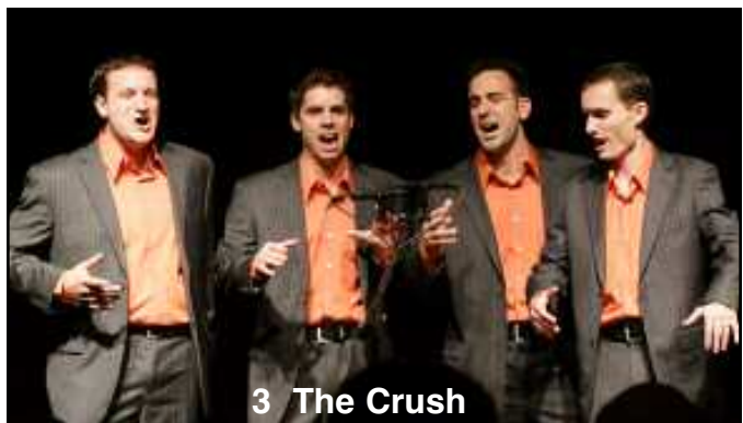
3 The Crush