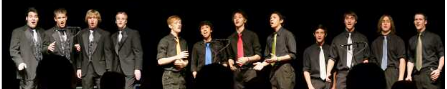
JAG - Liberty HS