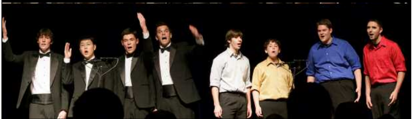
1 Timbre-Rings - Westview HS