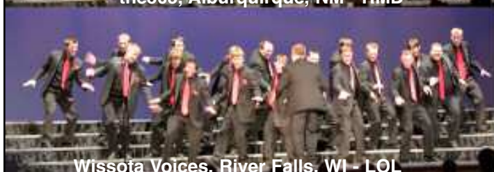
Wissota Voices, River Falls, WI - LOL

2009 Youth Festival, MidWinter Convention Pasadena, CA Northwest Vocal Project is the 2009 Champion. The other youth choruses are listed alphabetically. We of the BHS are fortunate to have these young men participating so enthusiastically in our great hobby.