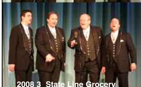
2008 3 State Line Grocery

The attendees at the MidWinter Convention were privileged to witness performances from the 2008 top 5 medalist quartets: 1 OC Times 2 Crossroads 3 State Line Grocery 4 Redline 5 Old School the 2008 Chorus Champions Masters of Harmony, the 2008 College Quartet Champions Ringmasters from SNOBS, the 2008 Senior Quartet Champion Eureka the 1998 Senior Quartet Champion Jurassic Larks the 2006 Senior Quartet Champion Antique Gold the 2009 Senior Quartet Champion Audacity and a special appearance of VoCA, a group comprised of a number of past Gold Medal Quartet members from the BHS and SAI. Who could ask for anything more?