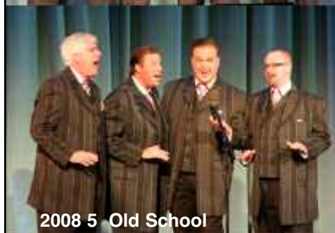
2008 5 Old School