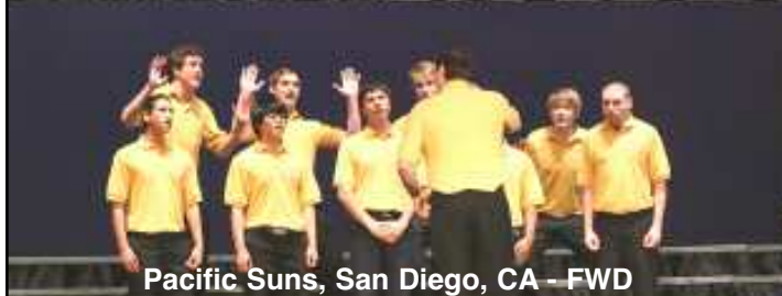
Pacific Suns, San Diego, CA - FWD