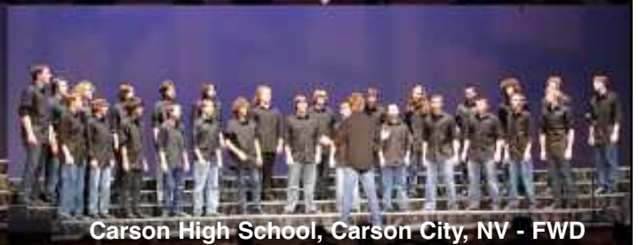
Carson High School, Carson City, NV - FWD