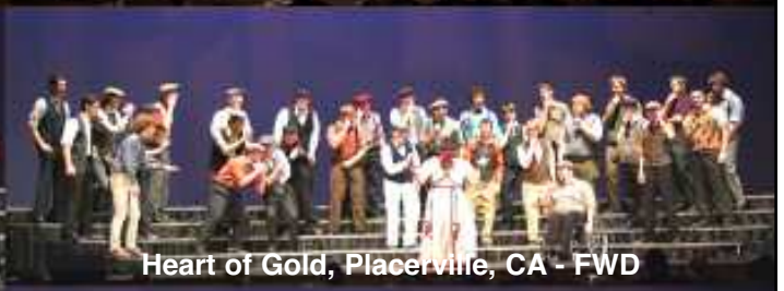
Heart of Gold, Placerville, CA - FWD