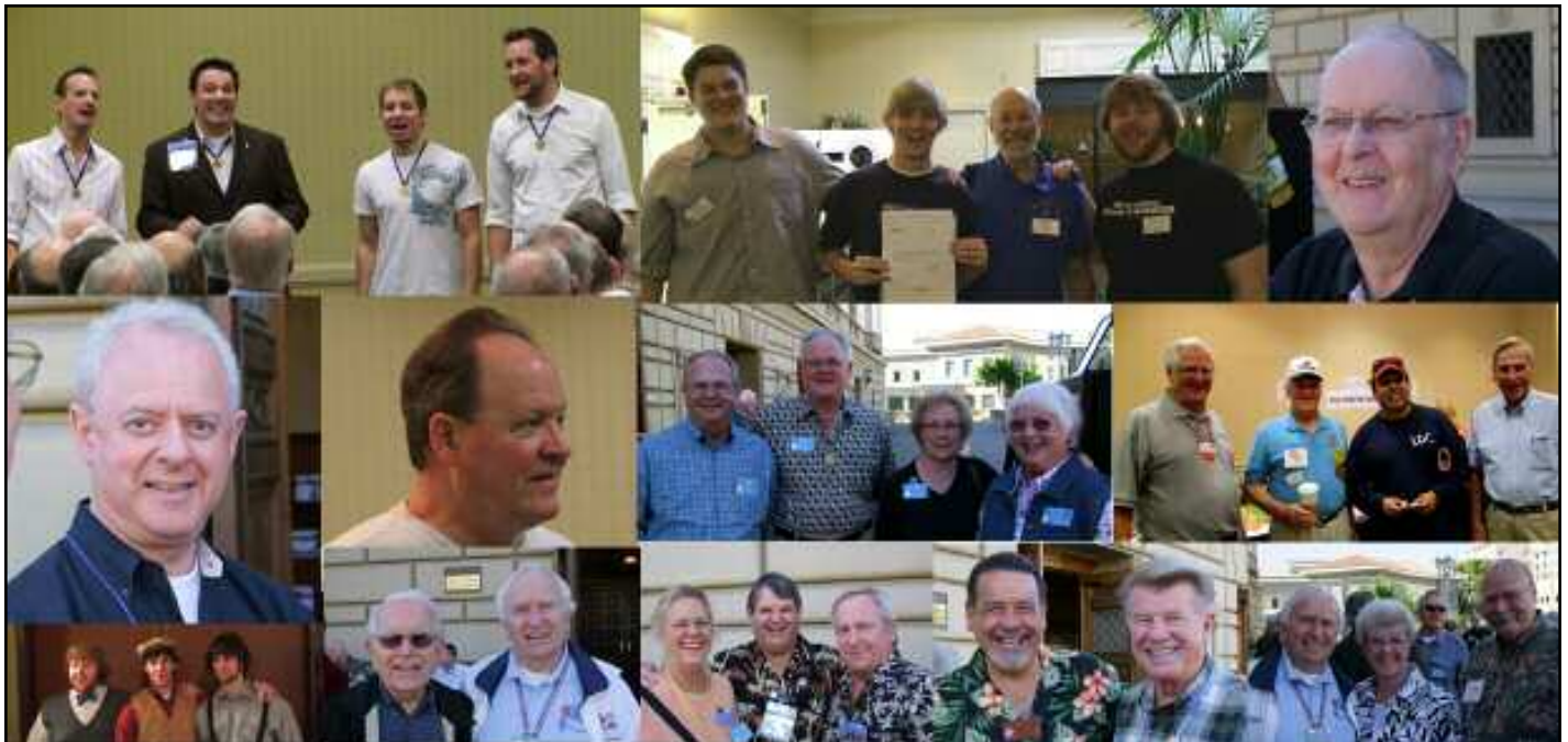
Also seen around MidWinter Convention