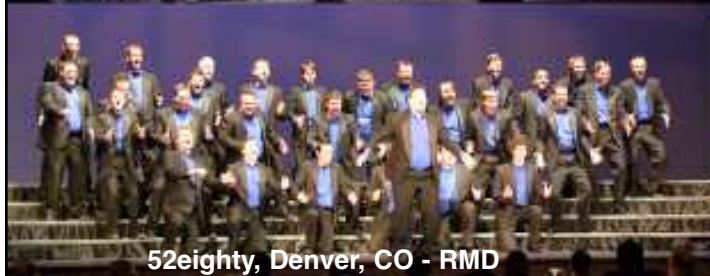
52eighty, Denver, CO - RMD