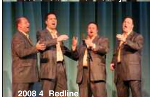
2008 4 Redline