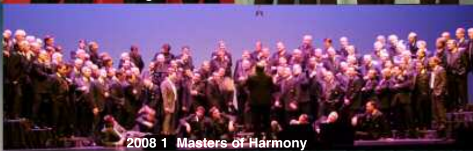
2008 1 Masters of Harmony