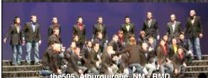
the505, Albuquerque, NM - RMD