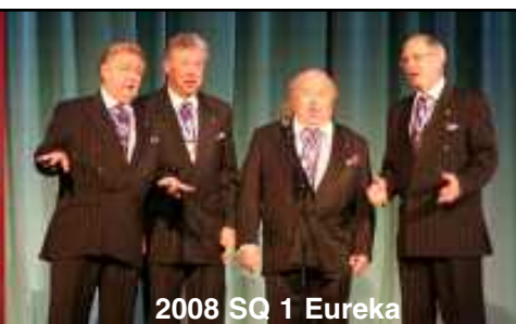
2008 SQ 1 Eureka