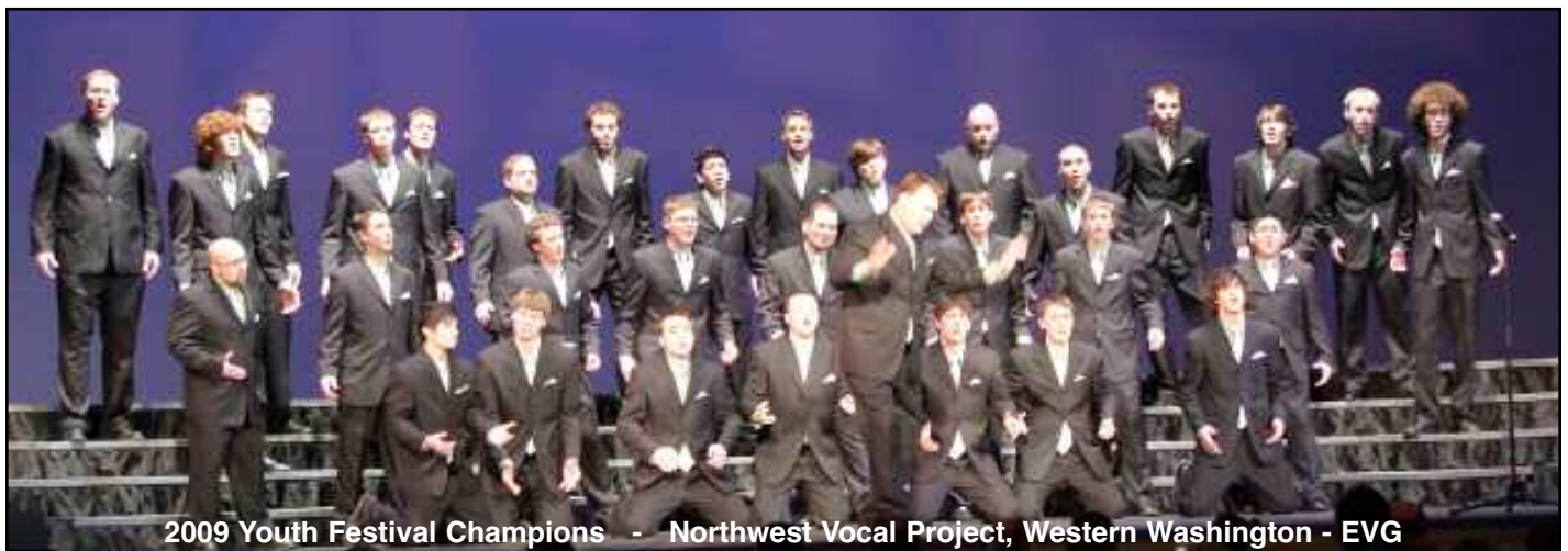
2009 Youth Festival Champions - Northwest Vocal Project, Western Washington - EVG