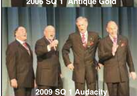
2009 SQ 1 Audacity