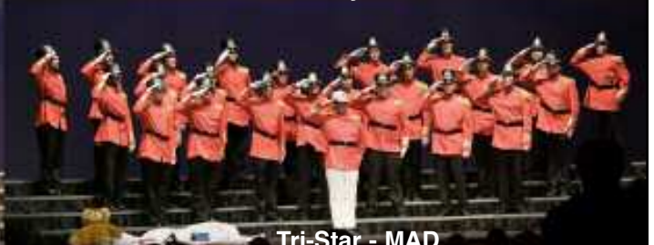
Tri-Star - MAD