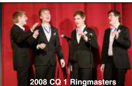
2008 CQ 1 Ringmasters