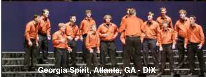
Georgia Spirit, Atlanta, GA