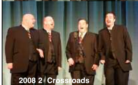
2008 2 Crossroads