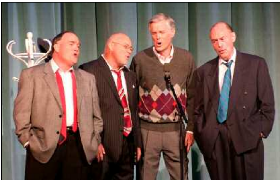
2009 International Senior Quartet Champion Audacity [FWD]