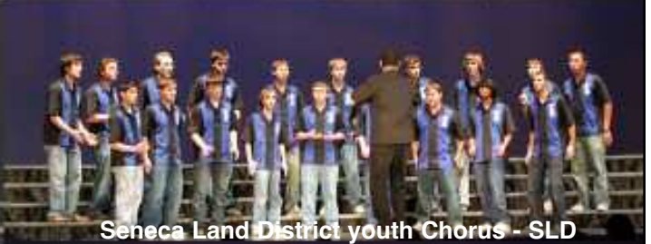
Seneca Land District youth Chorus - SLD