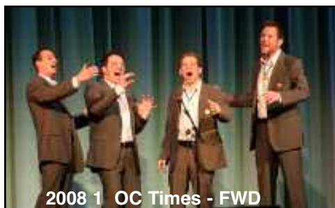
2008 1 OC Times - FWD