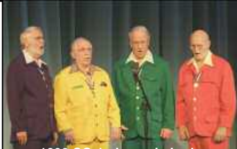
1998 SQ 1 Jurassic Larks

The attendees at the MidWinter Convention were privileged to witness performances from the 2008 top 5 medalist quartets: 1 OC Times 2 Crossroads 3 State Line Grocery 4 Redline 5 Old School the 2008 Chorus Champions Masters of Harmony, the 2008 College Quartet Champions Ringmasters from SNOBS, the 2008 Senior Quartet Champion Eureka the 1998 Senior Quartet Champion Jurassic Larks the 2006 Senior Quartet Champion Antique Gold the 2009 Senior Quartet Champion Audacity and a special appearance of VoCA, a group comprised of a number of past Gold Medal Quartet members from the BHS and SAI. Who could ask for anything more?