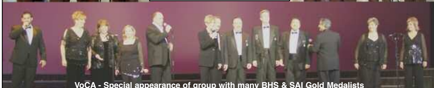
VoCA - Special appearance of group with many BHS & SAI Gold Medalists