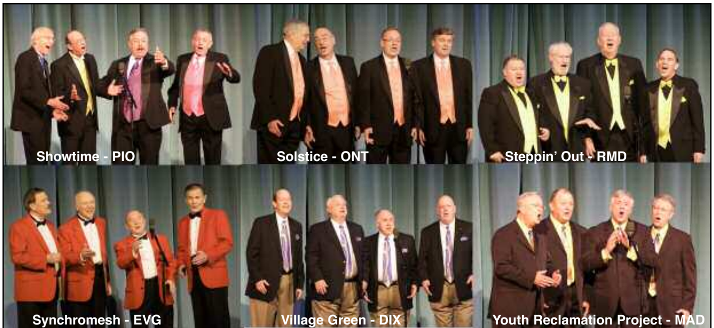
MidWinter Senior Quartet Contest Ranks 1 - 5. The rest are listed alphabetically. Continued From Inside Front Cover