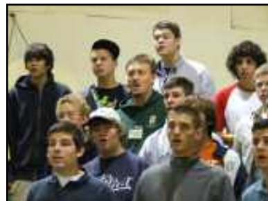
Boys in focus during rehearsal

At the FWD Youth Harmony Camp we do not focus on the Sunday morning show. I'll say that again, we do not put a lot of our energies into preparation for the Sunday morning show. We do present a one-hour show Sunday morning for parents and friends. Costumes and props are not used. The boys simply sing and have fun showing parents and friends what they have experienced and learned in their intensive weekend experience of being “hot dipped” in barbershop.