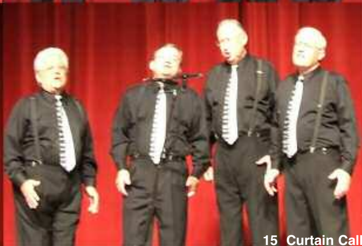
15 Curtain Call