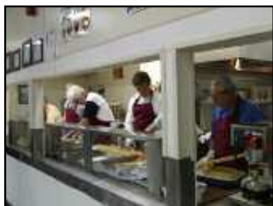
Chow line volunteers

focus on fundamentals: the fundamentals of vocal singing, proper breathing, posture and basics. Over the weekend the boys experience living in the wonderful environment of barbershop harmony through their learning of four or five songs, learning and singing tags, and participation in the totally positive culture of barbershop.