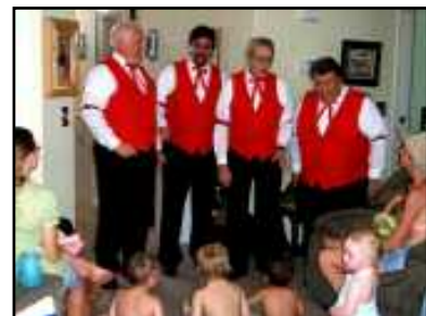
Broadcast singing Happy Birthday

"Your willingness to take the time and lend your talents to expressing those feelings on my behalf is something I will never forget. Your exceptional performance really meant a great deal to me and my family. Again, I thank you and wish all of you the best."