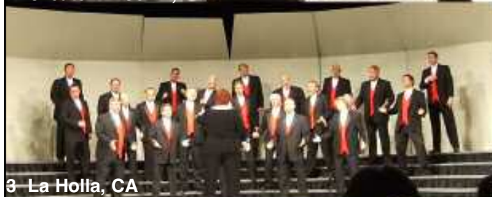
3 La Holla, CA