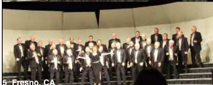
5 Fresno, CA