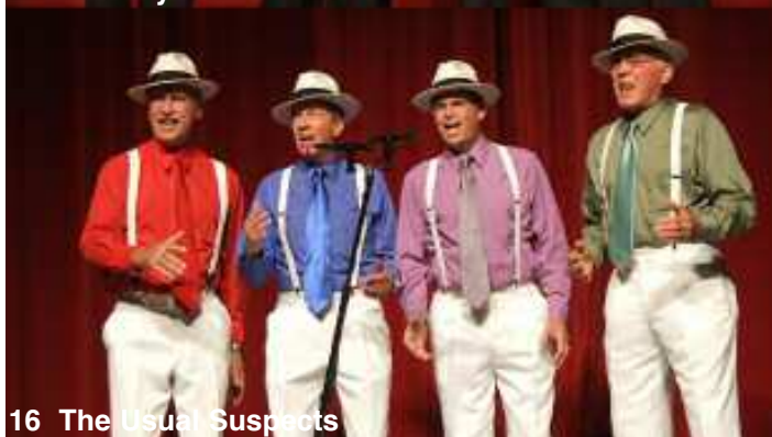
16 The Usual Suspects