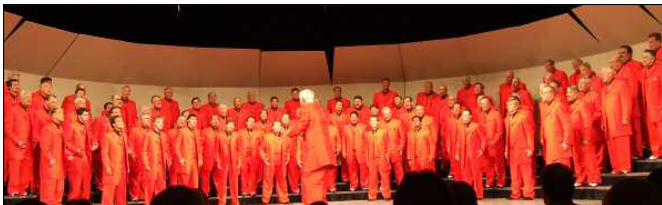
Voices in Harmony 2008 FWD Chorus Champions

The FAR WESTERN DISTRICT includes Arizona, California, Hawaii, Nevada and Southern Utah