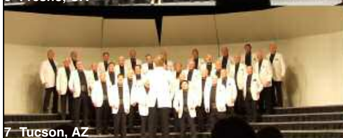
7 Tucson, AZ