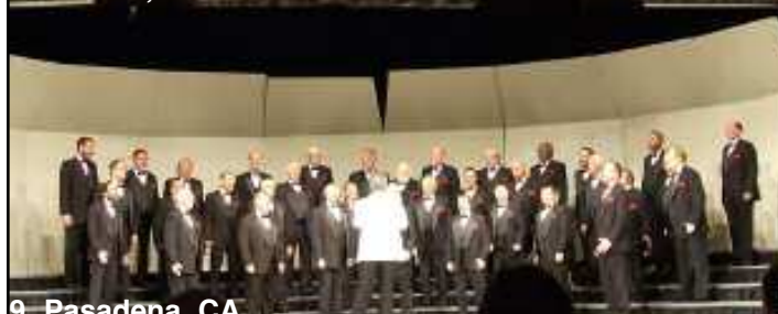
9 Pasadena, CA