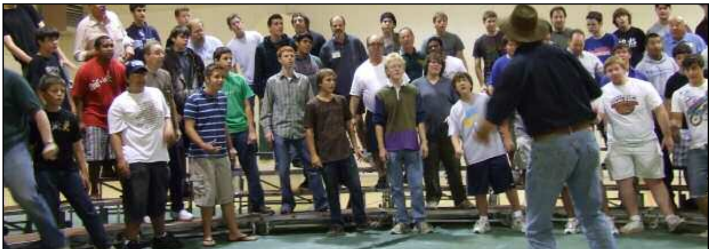
A move was learned for the show - “The Lean”

The young men truly appreciate and benefit from the support provided by so many FWD Chapters and so many of you individually.