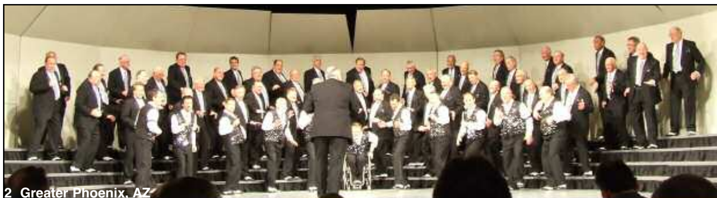
2 Greater Phoenix, AZ