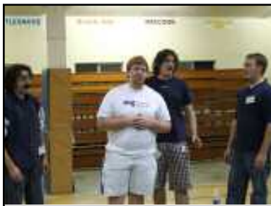
College Quartet EPIC in action