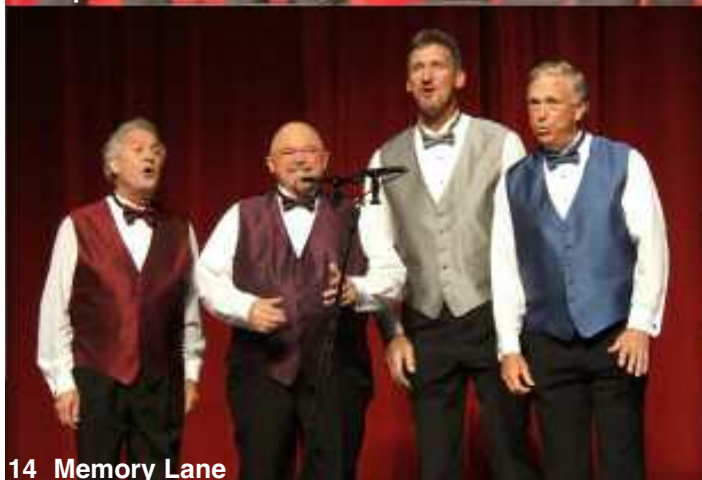
14 Memory Lane