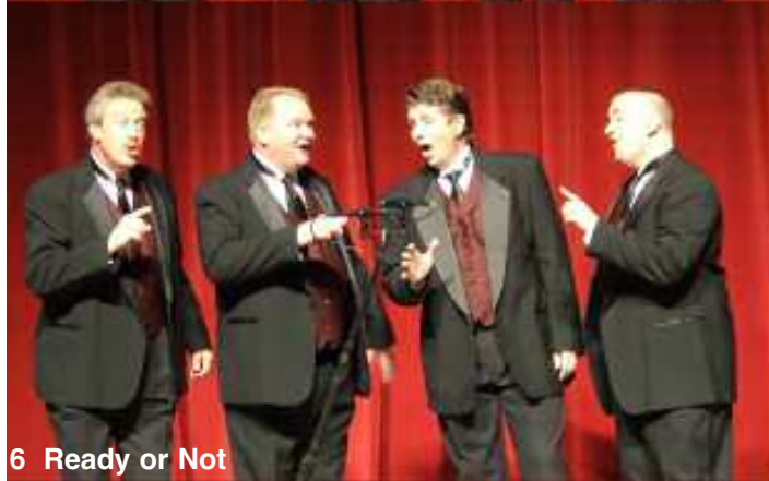
6 Ready or Not