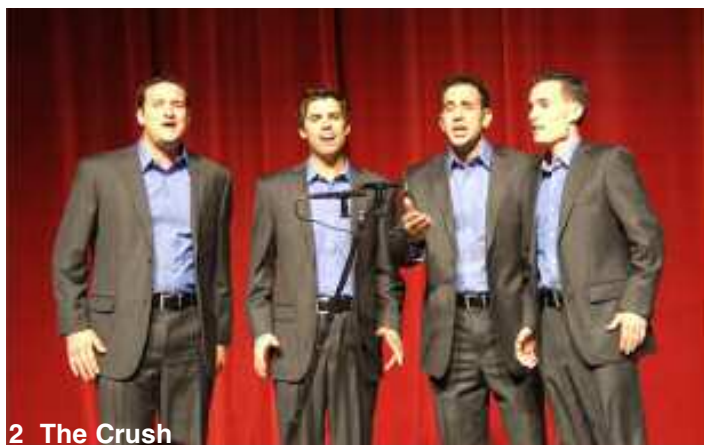
2 The Crush