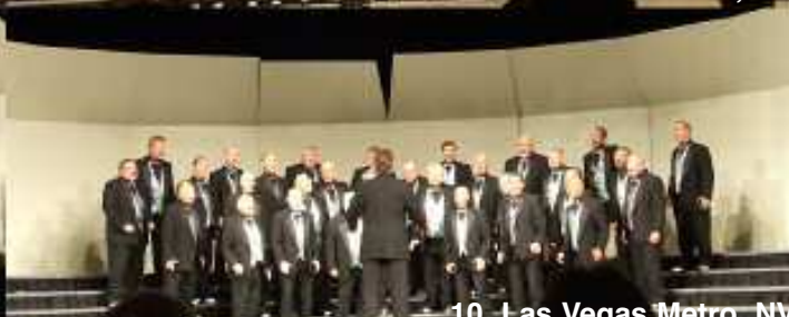
10 Las Vegas Metro, NV