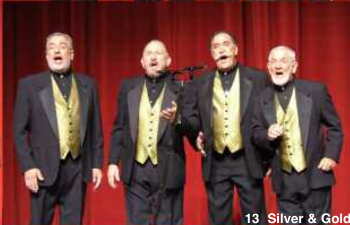
13 Silver & Gold