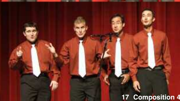
17 Composition 4