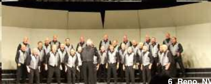
6 Reno, NV