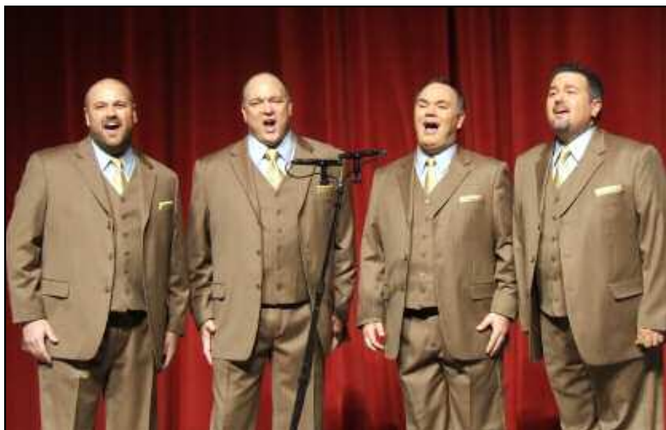
Masterpiece 2008 FWD Quartet Champions