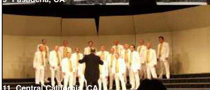
11 Central California, CA