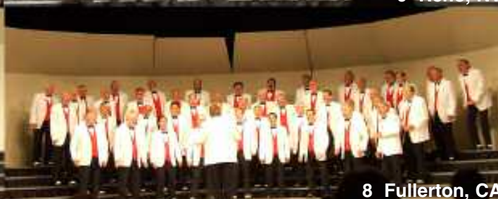
8 Fullerton, CA