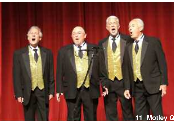
11 Motley Q