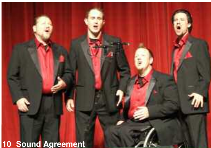
10 Sound Agreement