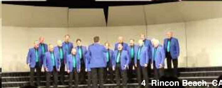
4 Rincon Beach, CA