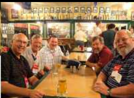
HCW Staff Rests