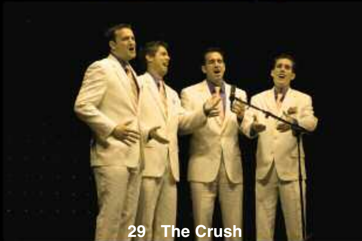
29 The Crush