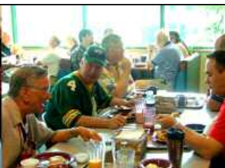
3 Gold Medals Chat