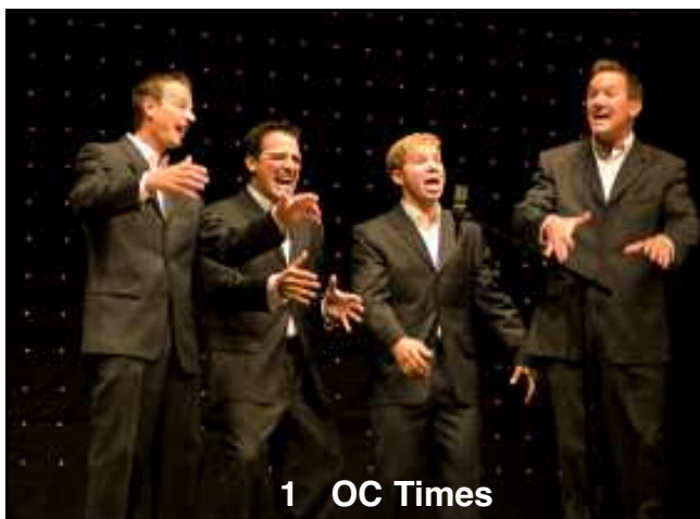
1 OC Times