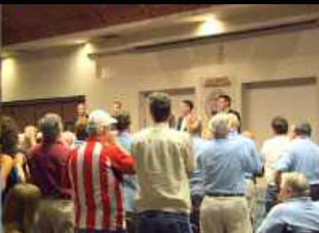
Reatime Gets Standing "O"