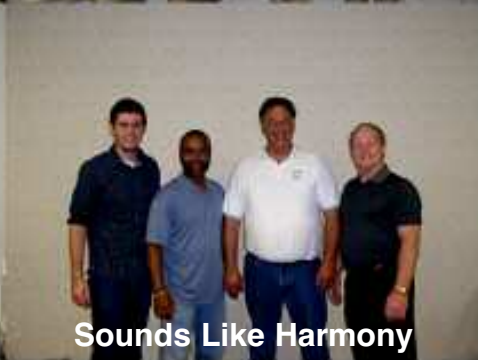
Sounds Like Harmony