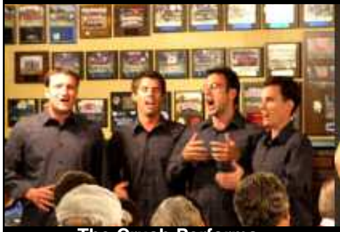
The Crush Performs