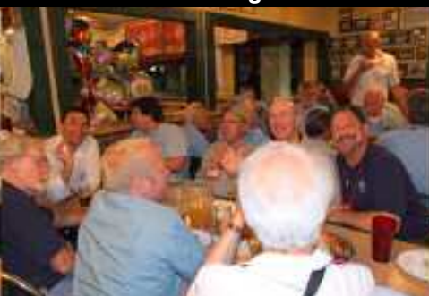
Pizza Is Good