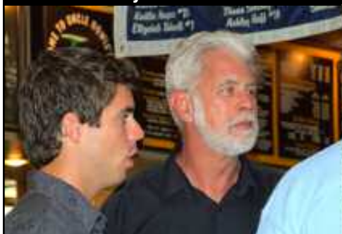
Father & Son