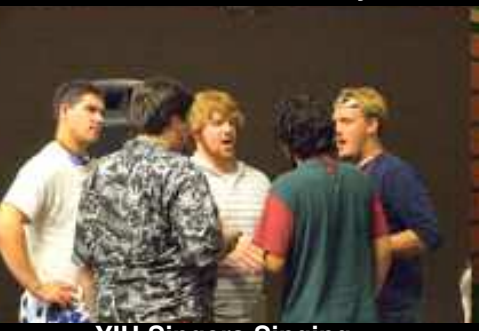
YIH Singers Singing