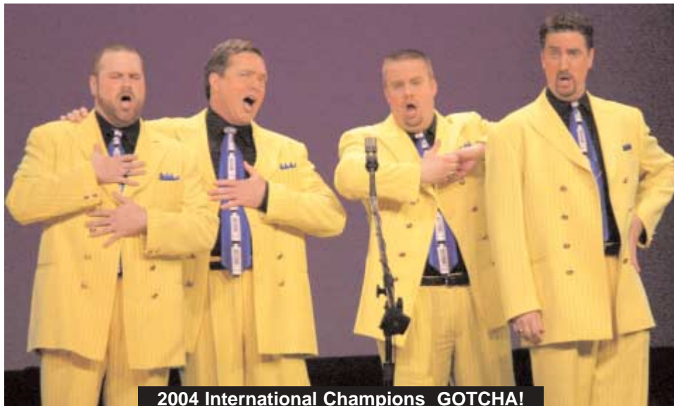
2004 International Champions GOTCHA!