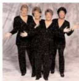
A Capella Gold 2001 Sweet Adeline International Quartet Champions Four Zany Ladies with an incredible sound