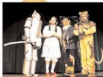
The Most Happy Fellows 1977 SPEBSQSA International Quartet Champions Performing their spectacular "Wizard of Oz" Package

November 6, 2004 - 8:02PM The Fox Theater, Bakersfield, CA. Featuring Four Awesome Quartets