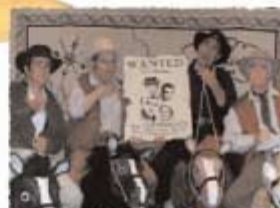
Late Night Barbershop 1997 SPEBSQSA International Semi-Finalists Performing their amazing "BONANZA" Package

Golden Circle: $40 (price includes reserved seat at the afterglow) Orchestra: $25 Balcony: $15 Afterglow: $5 ($8 at the door)