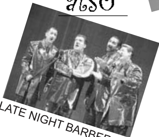
LATE NIGHT BARBERSHOP