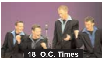
18 O.C. Times