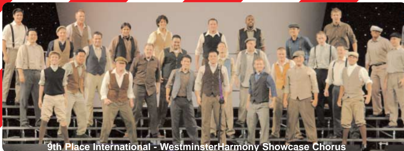
9th Place International - Westminster Harmony Showcase Chorus

13-16 FWD Fall Convention Pasadena [host: Santa Fe Springs]