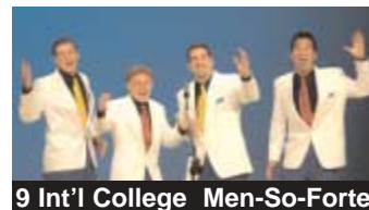
9 Int'l College Men-So-Forte