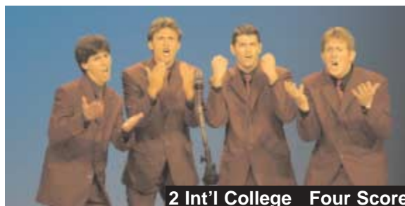
2 Int'l College Four Score