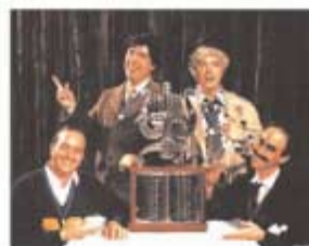
The New Tradition 1985 SPEBSQSA International Quartet Champions Performing their hilarious "Marx Brothers" Package