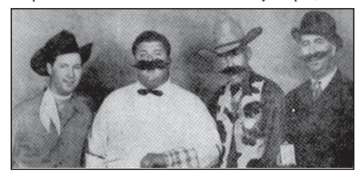
The "Westernaires" 1949 Far Western District Champions

The La Canada and Lakeside chapters were chartered in August 1948, followed by the Eureka Chapter in September, the Flagstaff, Arizona Chapter in October and the Peninsula Chapter in November 1948. The Salt Lake City Chapter, which