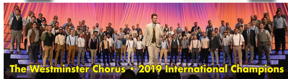
The Westminster Chorus • 2019 International Champions