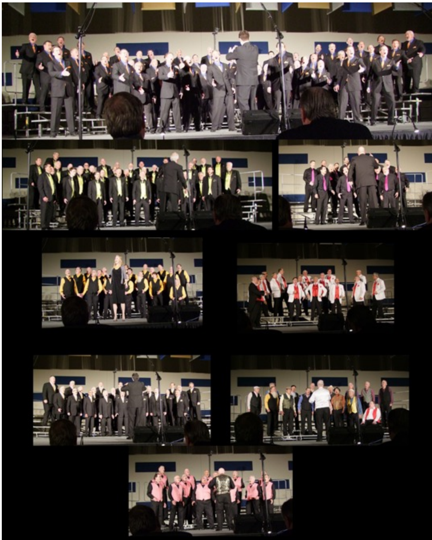
NorthEast Division Chorus Contestants