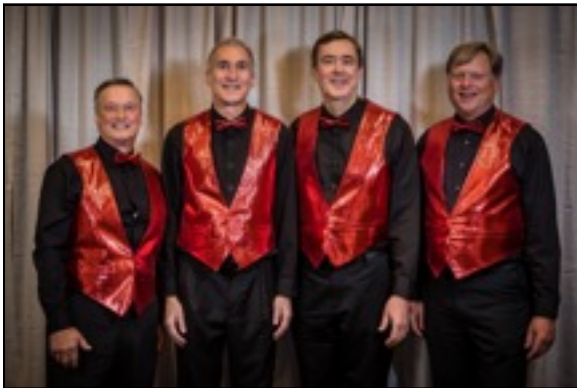
3rd Place Upside Sounds

The Walnut Creek Chapter was pleased to once again host the Northern California Novice Quartet Contest on March 3, 2015 in Walnut Creek. Ten Quartets competed and 2 of 3 High School Quartets participated for contest experience prior to the FWD HSQC at the Spring Convention in Sacramento.