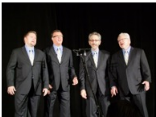
American Pastime 78.1