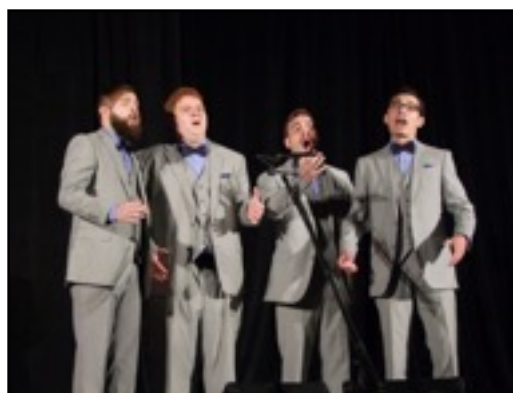
Newfangled Four 79.7