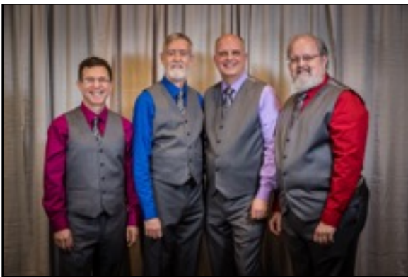
2nd Place In Flux