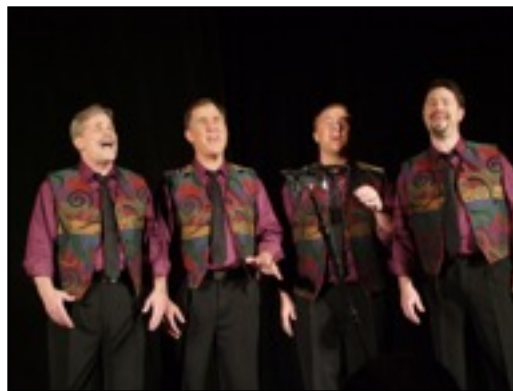
Artistic License 84.7