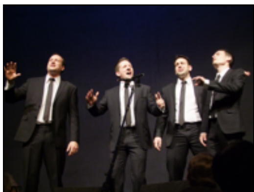
The Crush 85.8