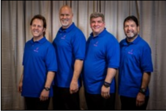
1st Place Belle Voci