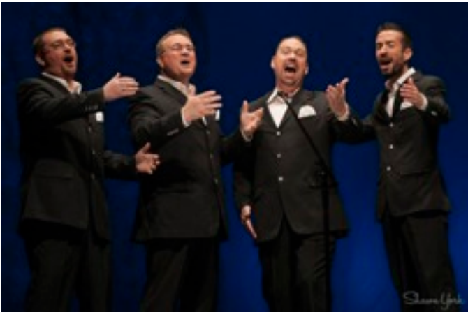
19 95 North