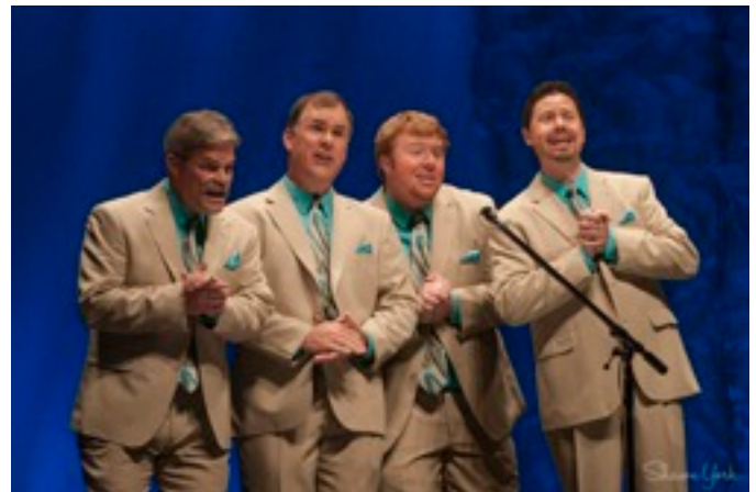
11 Artistic License