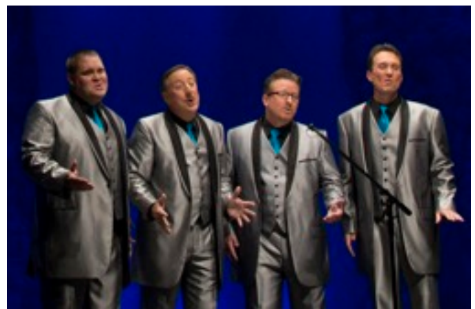
31 Vintage Edition