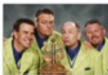
Storm Front our 2010 Teaching Quartet 2010 International Quartet Champions

HARMONY CAMP...Fun...ringing-chords...friends...ice cream...tags...talent-show...music...mentors...international-champions...ping-pong...barbershop...vocal production...rehearsal...singing...quartet coaching