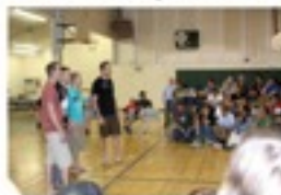
OC Times on Sunday Farewell Show

Time at camp is divided among general sessions with all campers and mentors...smaller class sessions affording the campers a chance to ask questions and interact with the clinicians and teaching quartets...time to relax...fun social activities like the camp talent show and sing along. Choral directors are always welcome to join us at no cost and we have a special session devoted to your questions and concerns. All meals...and nightly ice cream...are served in the dining hall. Hot meals are prepared by the camp staff and served by an army of Barbershoppers. The staff to camper ratio is roughly 1:2.