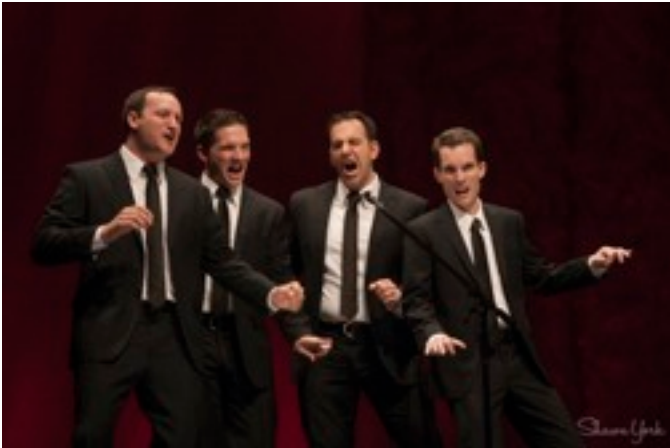
6 The Crush