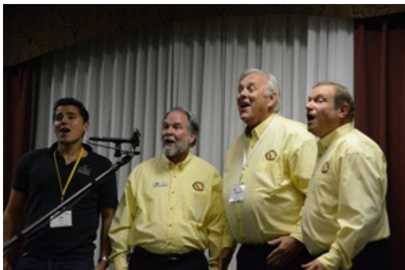
HSHB

Last weekend (Aug 23-25, 2013), I and some 75 other barbershop quartetting fanatics got together in Reno at the High Sierra Harmony Brigade to sing our hearts out, visit several high schools to "spread the good word about the barbershop style" and perform in a show for a highly enthusiastic audience ... oh, and we also held a rather unique quartet competition along the way.