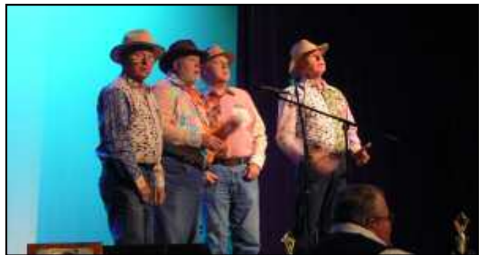
1st Place Harmony Connection [Conejo Valley]

The Orange Chapter thanks all who participated and helped carry on the tradition of good barbershop comedy and quartetting through this contest.