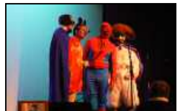
3rd Place 4 Squares [Orange]