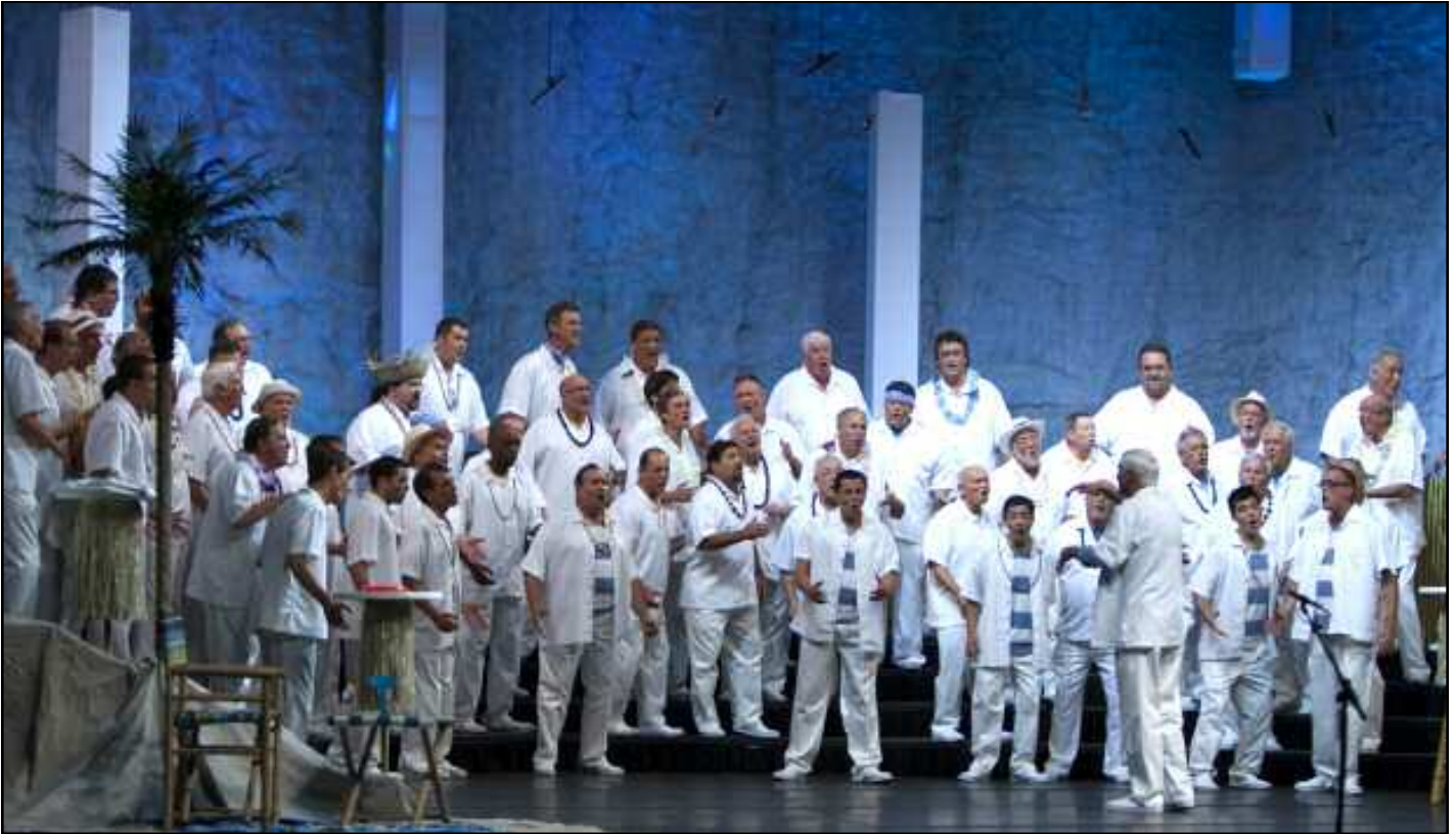
10 Bay Area "Voices in Harmony" 85.0