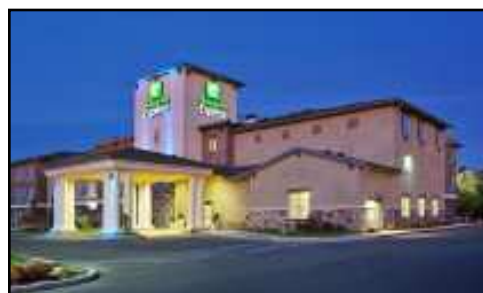
Headquarters Hotel Holiday Inn Express