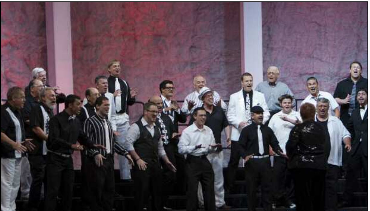
22 La Jolla 79.3