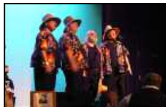
2nd Place Oddly Enuf [San Fernando Valley]