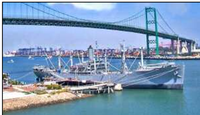
The Lane Victory at the Dock in San Pedro

It is now 60 years later and on a Saturday in Los Angeles it is raining cats and dogs. It's the first respectable rain we have had in a long while but as nice as that may be, in 24 hours the South Bay Coastliners are going to be celebrating their 60th Birthday out in the open, topside on the United States ship SS Lane Victory in San Pedro, California.