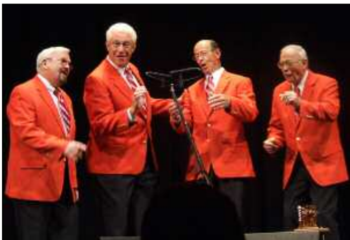
California Crossroads is the 2007 FWD Senior Quartet Champion and might be a "wild card" to San Antonio.