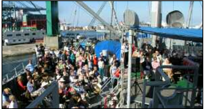
Over 500 Guests Attended the Celebration

Yet, in other parts of the ship, many first time visitors to this great military vessel visited the lower deck museum and took tours of the ship offered by the SS Lane Victory operators. This ship saw duty during World War II, the Korean and Vietnam conflicts and has a great history. While the ship remained at her berth during these festivities, the Lane Victory is fully operational with WWII-Cruises off Catalina during the summer months. It is one of Los Angeles' great points of interest.