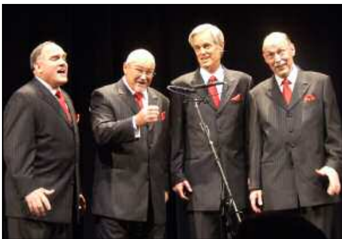
Audacity is the "Official" Senior Quartet representing the FWD in the 2008 International Senior Quartet Contest at the BHS Mid-Winter Convention and Contest in San Antonio.