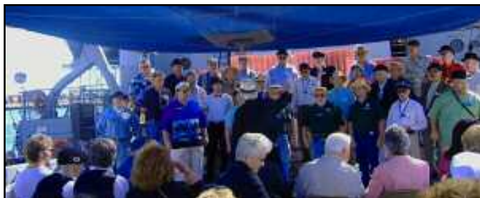
The Coastliners Open the Festivities

Sunday arrived in beautiful fashion with clear blue skies, comfortable temperatures and gentle breezes to make the perfect day for such a party. A brigade of chapter volunteers arrived prior to the event to prepare by setting up risers, tables, cooking areas, and refreshment stations. By three o'clock, guests started queuing up for ship boarding as they purchased tickets and passed through the newly-required anti-terrorist need to present picture identification to board the ship. Once that was out of the way, the event swiftly proceeded smoothly and wonderfully into the perfect day.