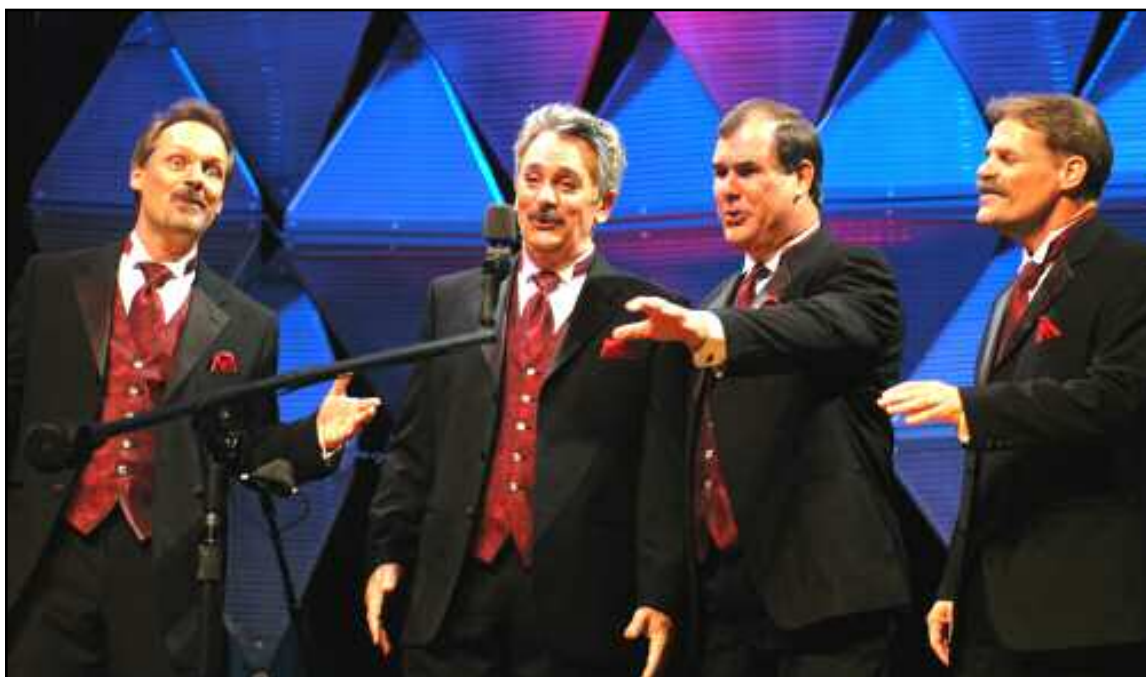
2007 FWD Champion Quartet VocalEase