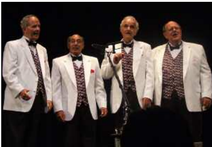
Harmony.com is the 2007 FWD Super Senior Quartet Champion.