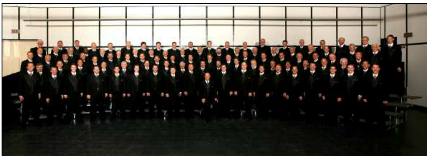
2007 FWD Champion Chorus Masters of Harmony

The FAR WESTERN DISTRICT includes Arizona, California, Hawaii, Nevada and Southern Utah