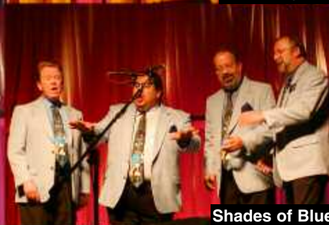
Shades of Blue