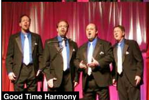
Good Time Harmony