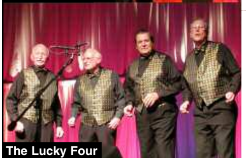
The Lucky Four