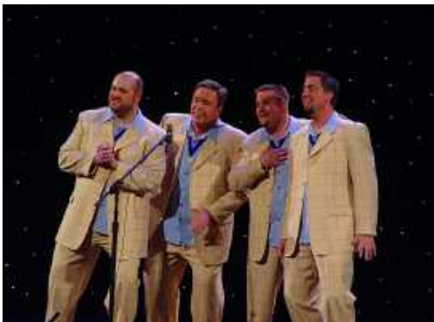
2004 Int'l Champs GOTCHA!