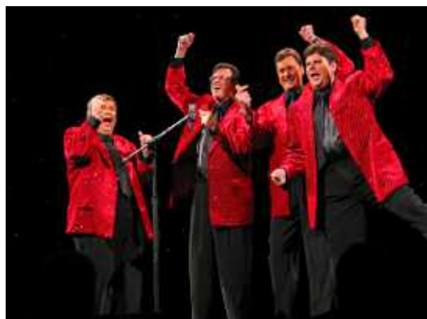
33 HiFidelity 78.2%