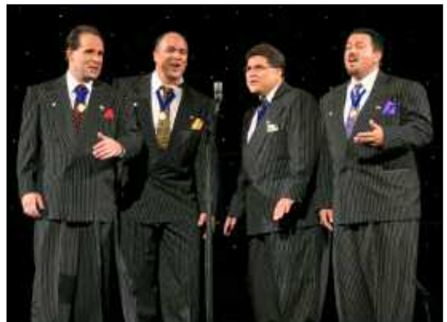
1996 Int'l Champs Nightlife