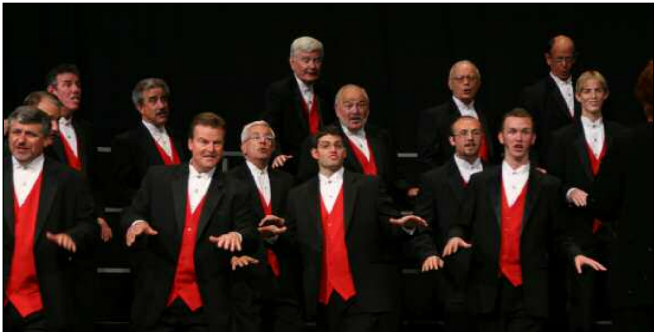
LaJolla Pacific Coast Harmony 79.8% [Wild Card Entry]