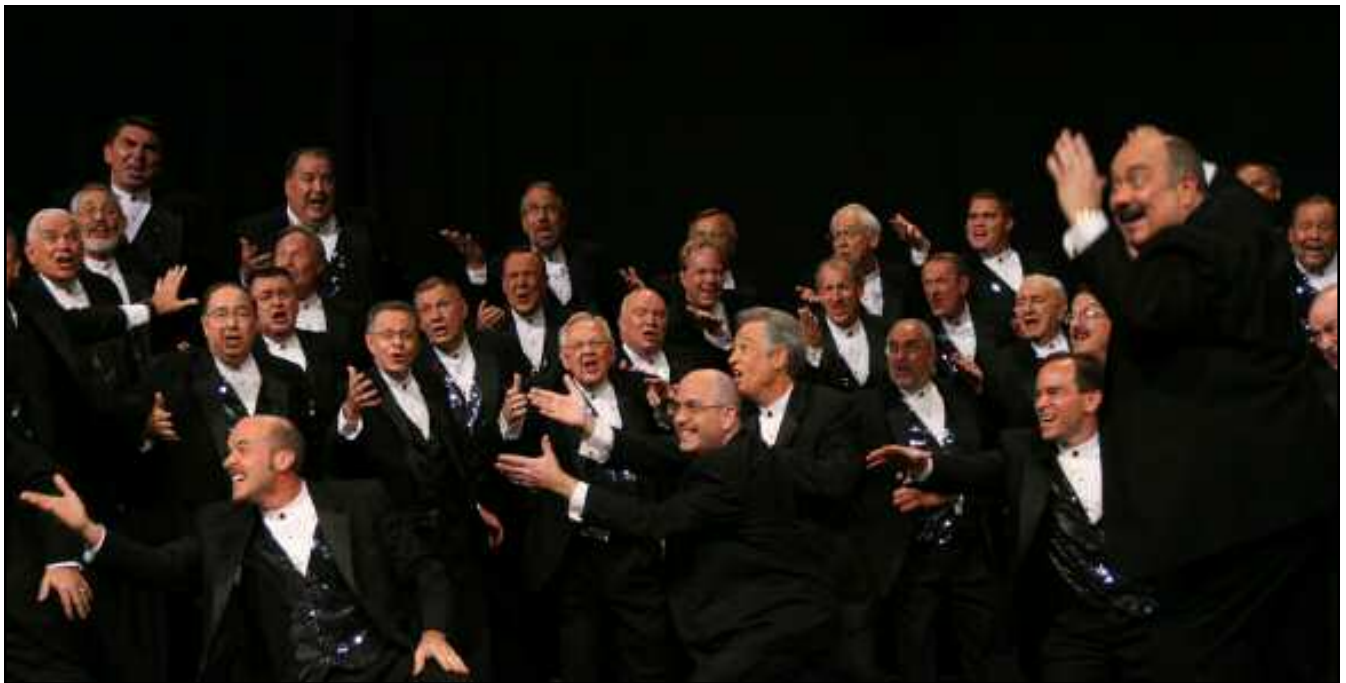
8 Spirit of Phoenix 86.8%