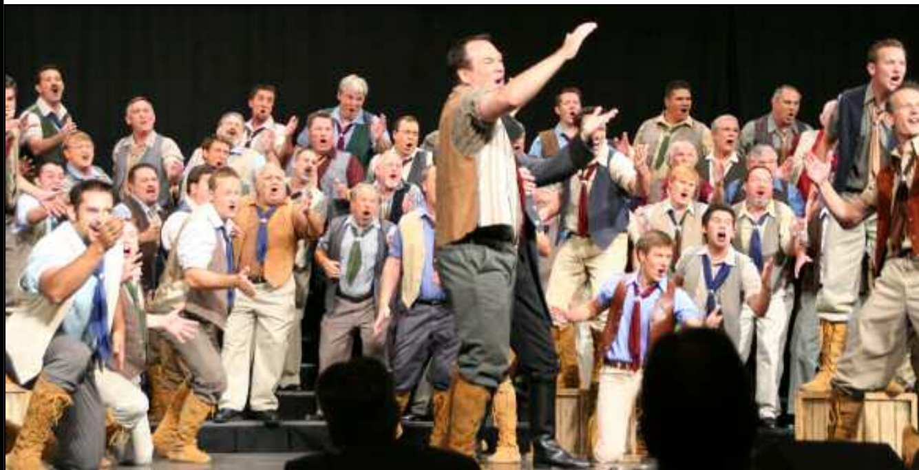
2005 International Chorus Champion Masters of Harmony 93.6%