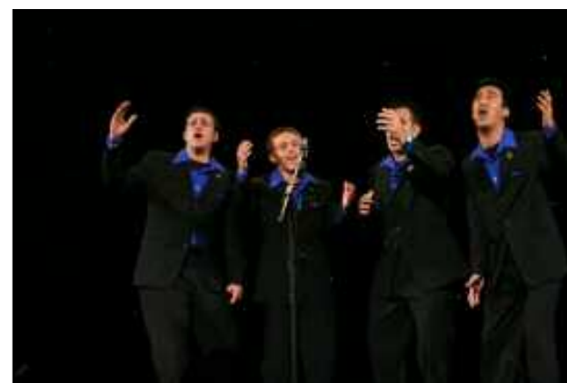
College Quartet 7 Men-So Forte