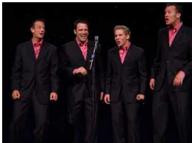
5 OC Times 87.2%

The FAR WESTERN DISTRICT includes Arizona, California, Hawaii, Nevada and Southern Utah