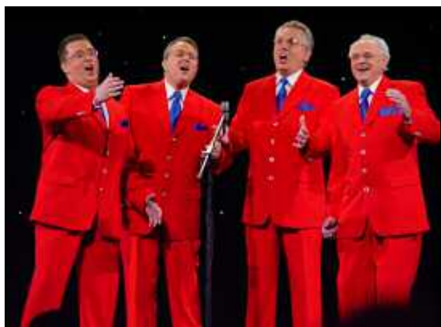
23 Stardust 79.7%