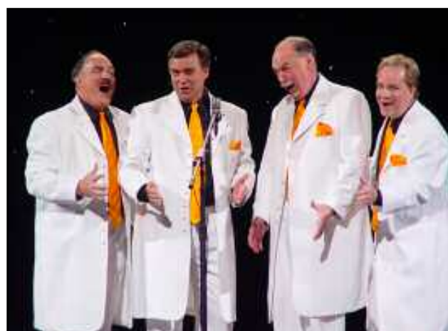
40 Dazzle! 76.9%