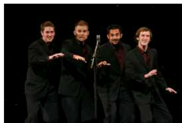
College Quartet 4 Afternoon Delight