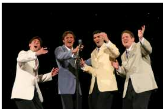
College Quartet 6 Four Score