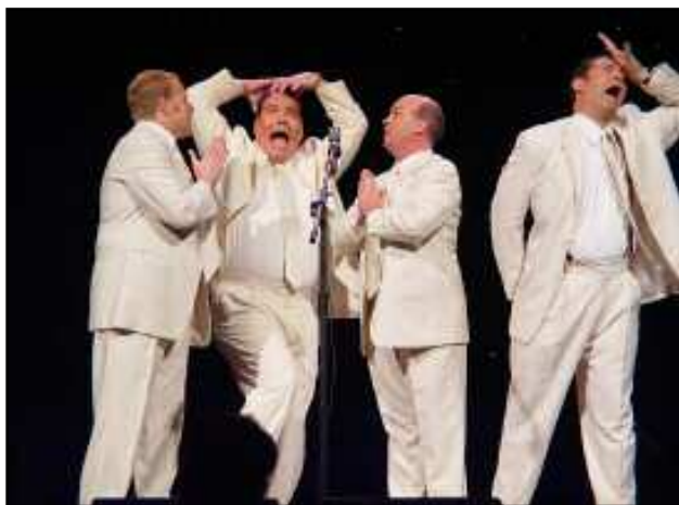
3 Metropolis 88.2%