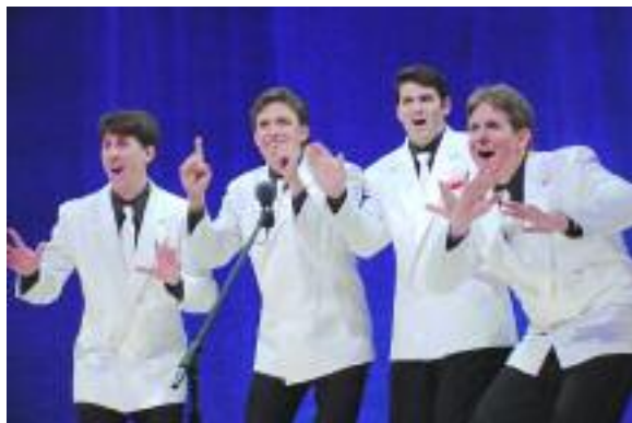
Four Score in Performance