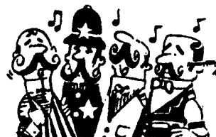
Senior Quartet Champs Far Western District 2001